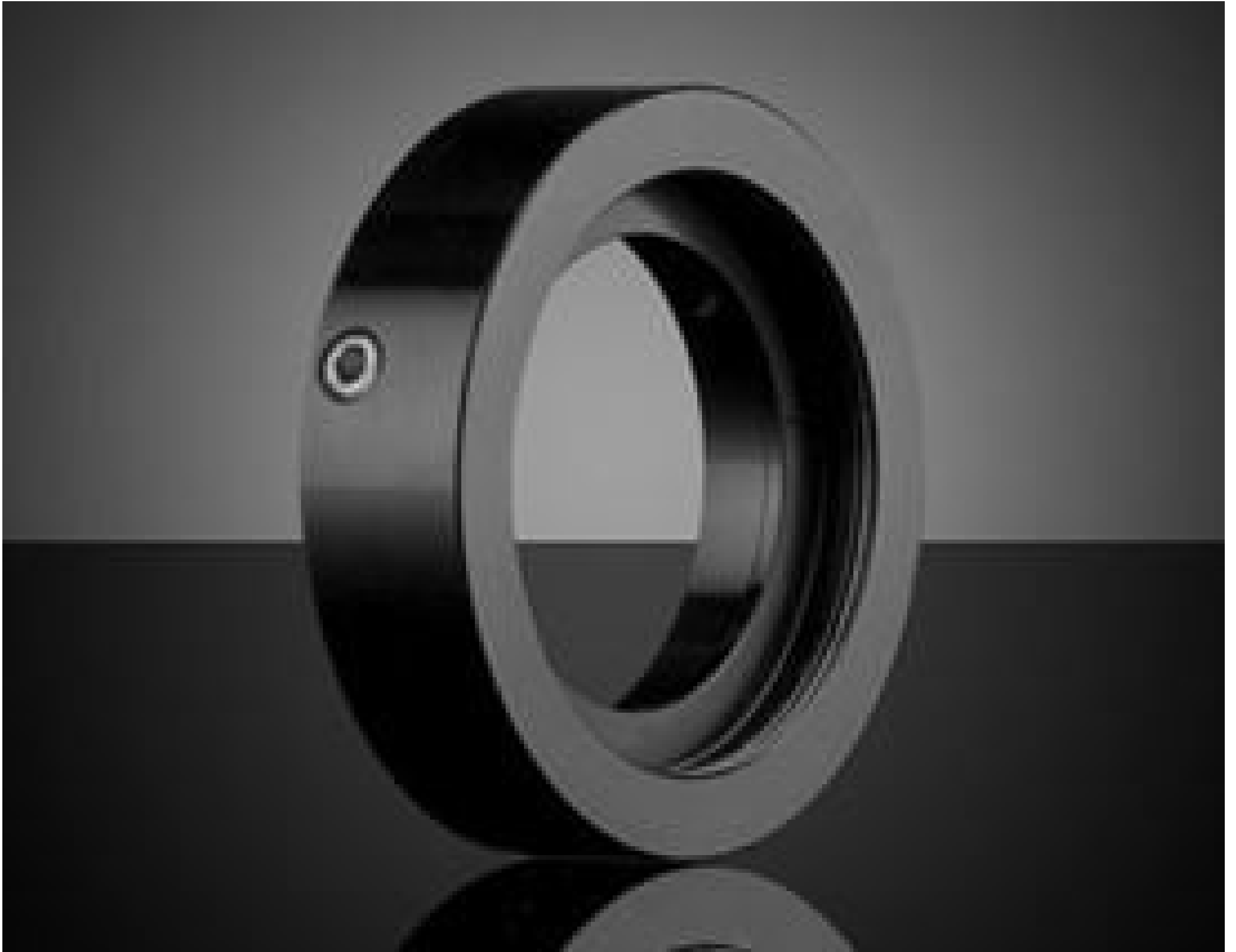
M25.5 x 0.5 Adapter for 22mm Dia. CompactTL™ Telecentric Lens, #88-213