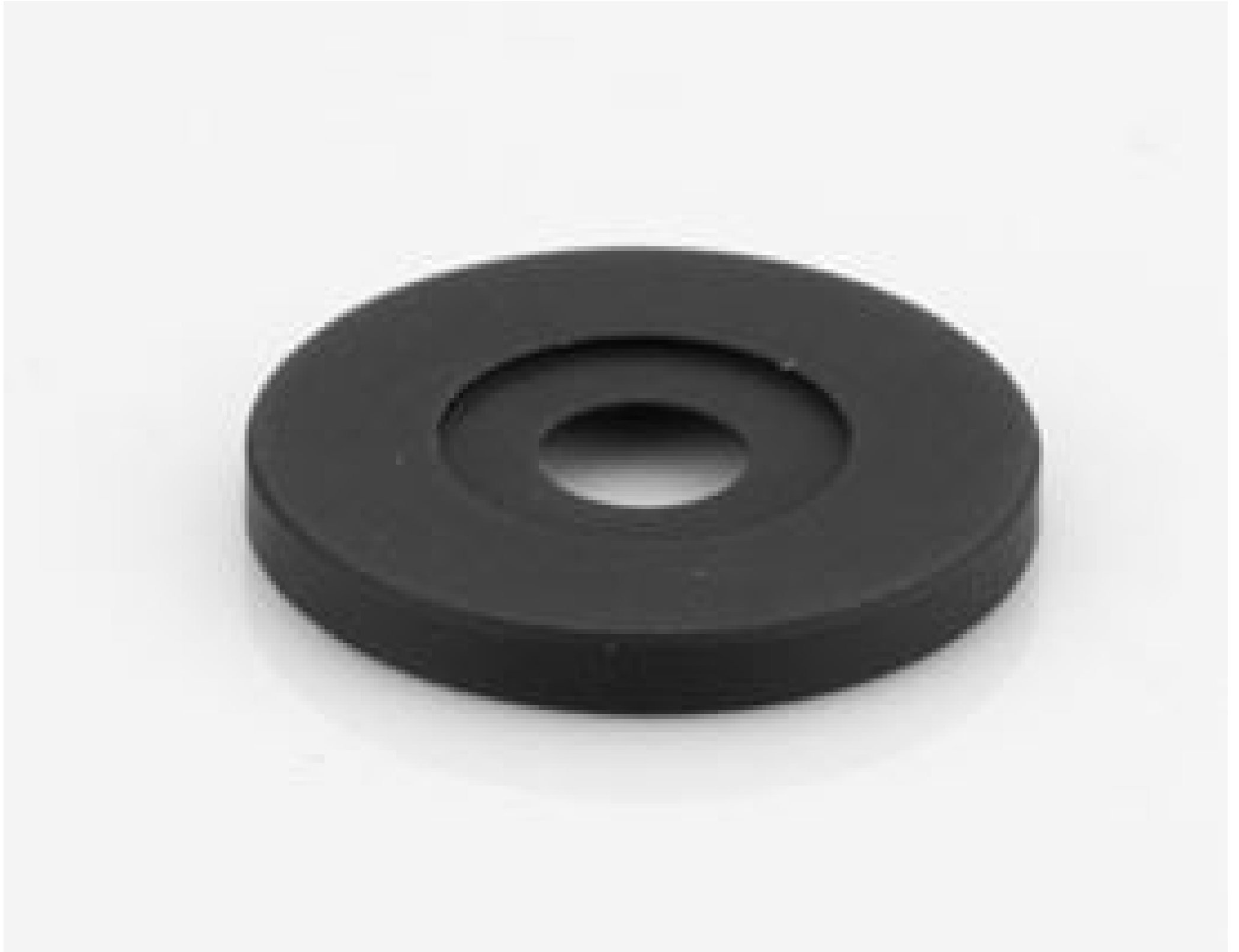
Aperture for Cx Lens (representative photo). Aperture varies by stock number. View PDF drawing for additional information.