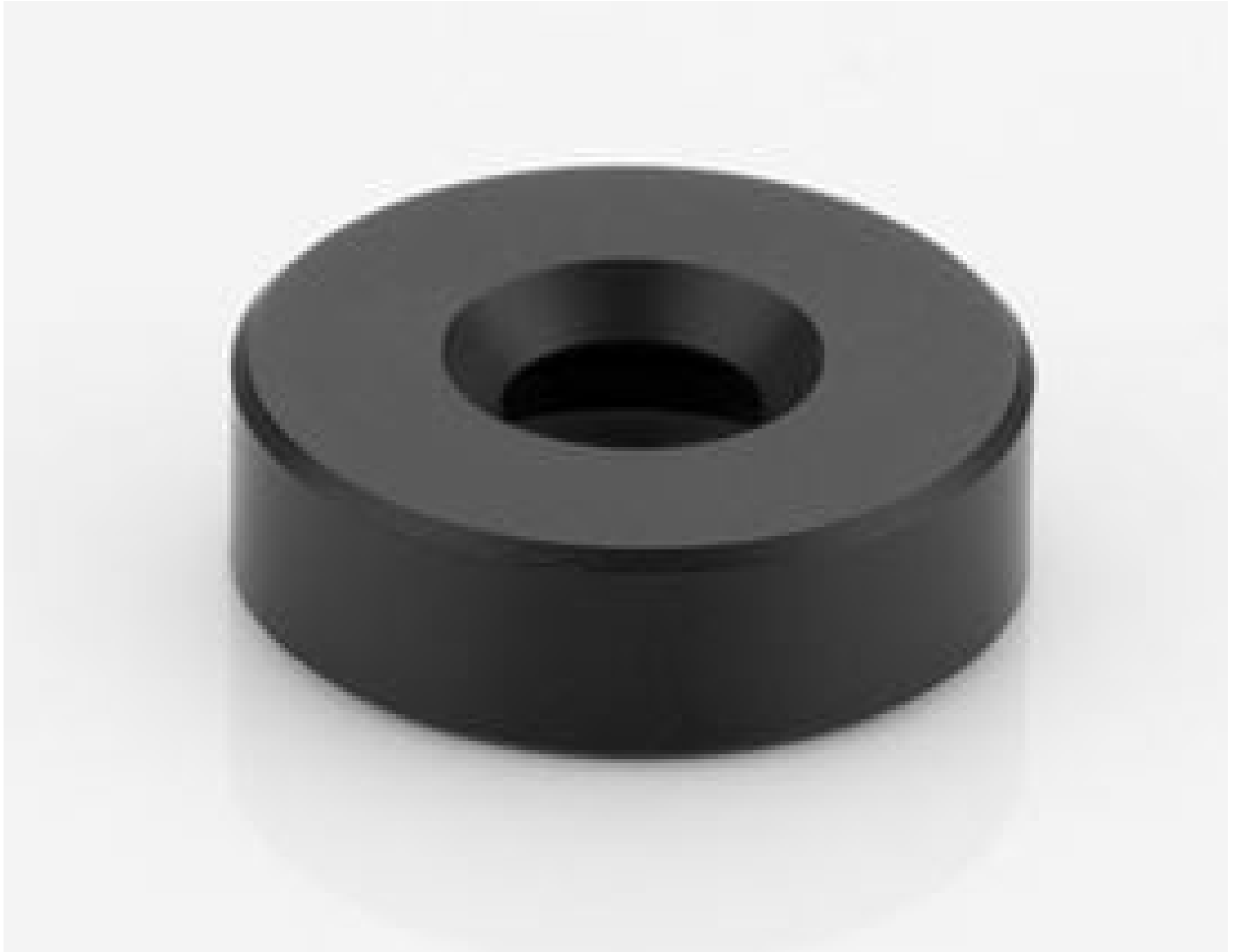
Filter Holder for 50mm Cx Lens (representative photo). Filter Holder varies by stock number. View PDF drawing for additional information.