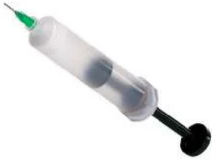
#55-044 - HandPlunger (3cc Barrel), Dispenser Units ₹3,957