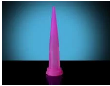
#55-063 - 20 Gauge (50 Count), UV Blocking Tapered Tips ₹6,531