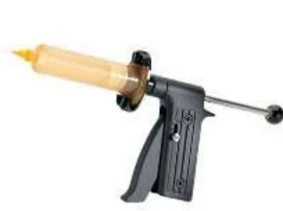
Dispensing Guns and Hand Plungers