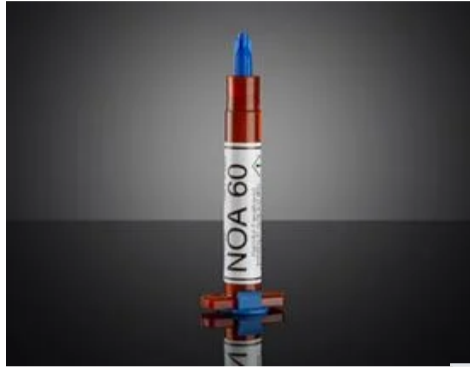
3cc Dispensing Barrel for NOA (NOA 60 shown as an example)