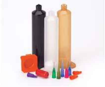
Dispenser Barrels and Accessories