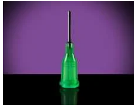
#55-068 - 1/2" Stainless Steel Tips, 18 Gauge (50 Count) ₹3,957