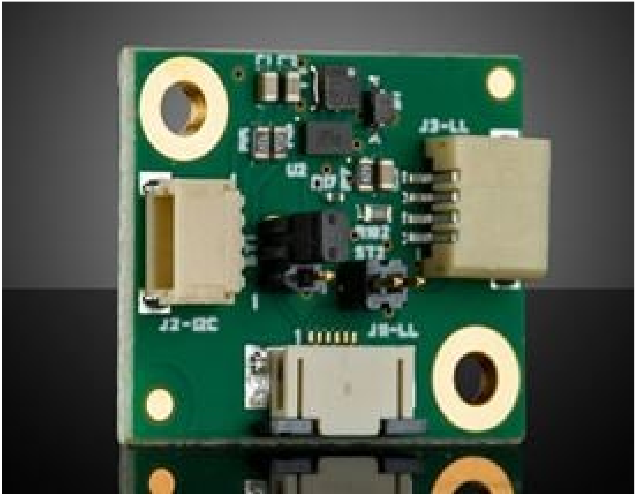
Corning® Varioptic® Variable Focus Liquid Lens Driver Board with Maxim MAX14574 Driver and I2C/DC Input