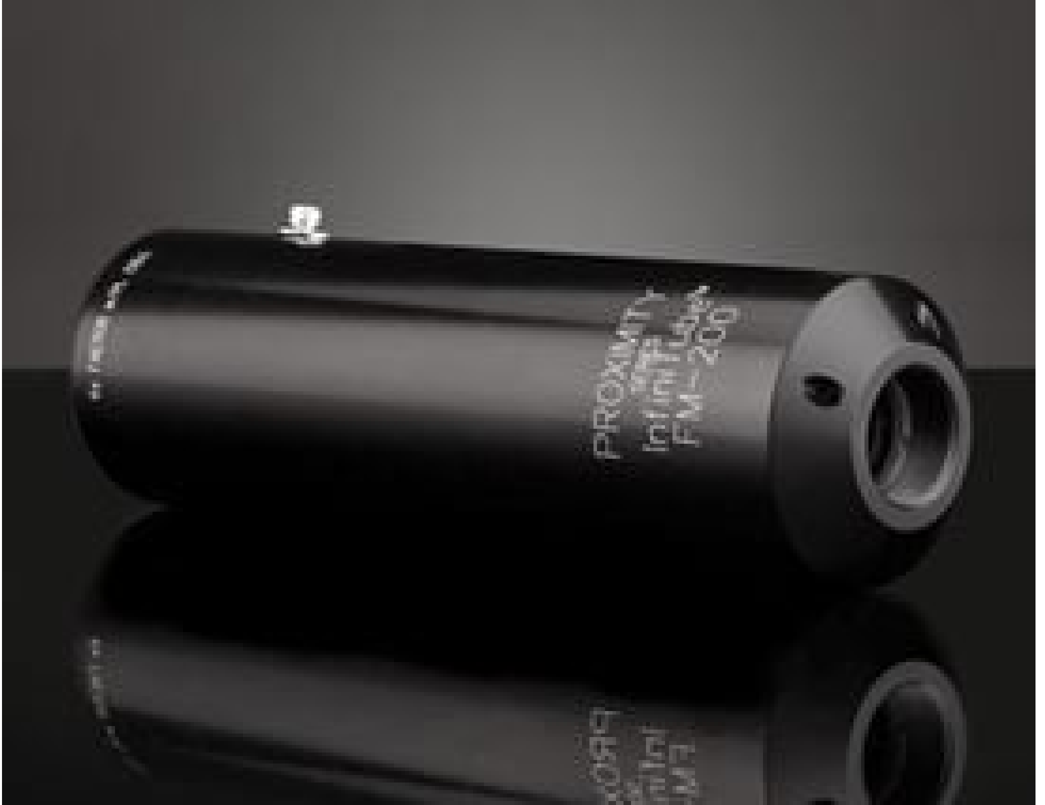
InfiniTube FM-200 (1X), #58-310

See More by Infinity Photo-Optical Company