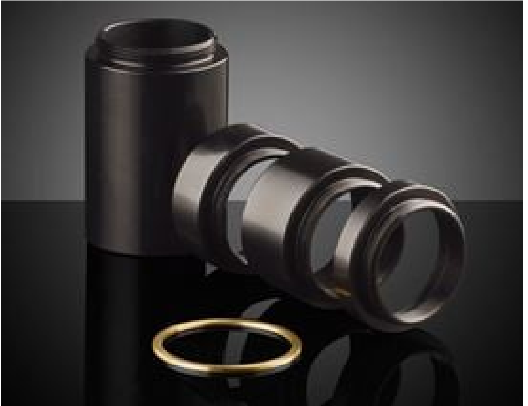
C-Mount Extension Tube Kit, #54-261