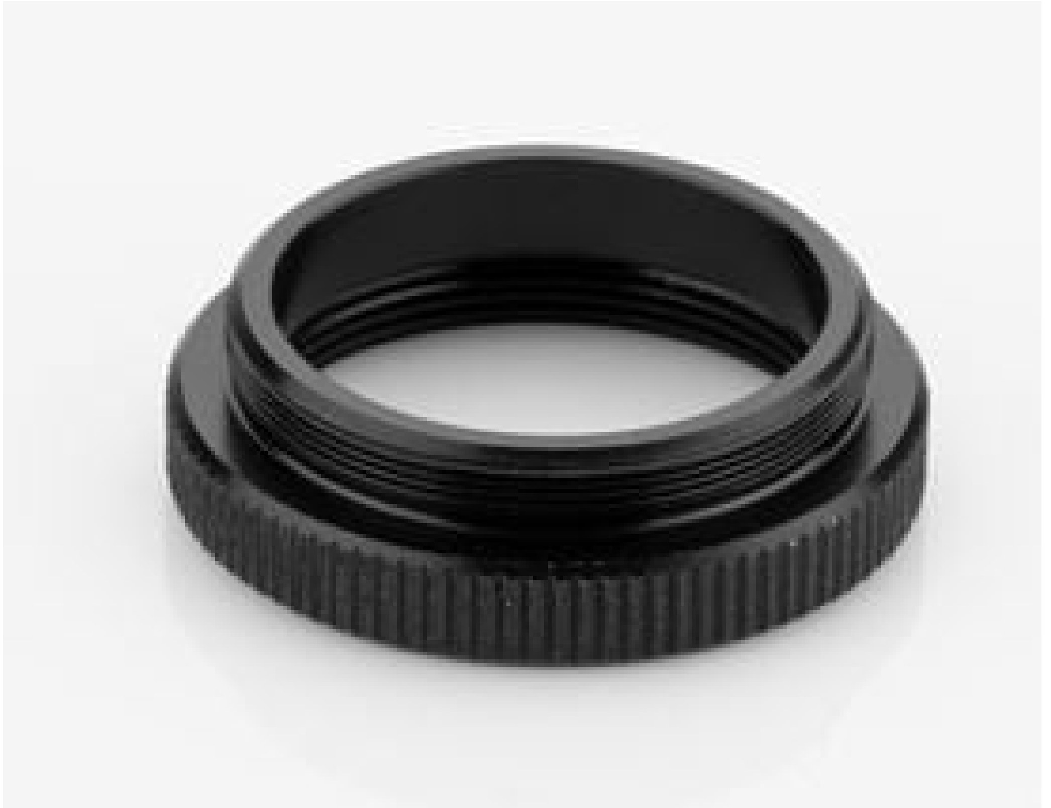
#56-784: C-Mount Adapter for 6 Position Filter Wheel and Assembly