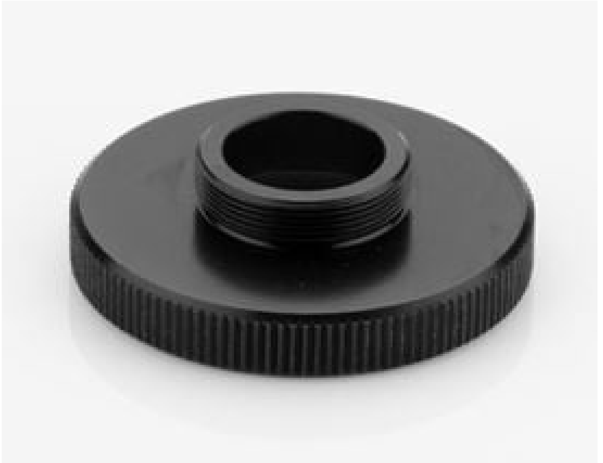
#58-184: C-Mount Adapter for 12 Position Filter Wheel and Assembly