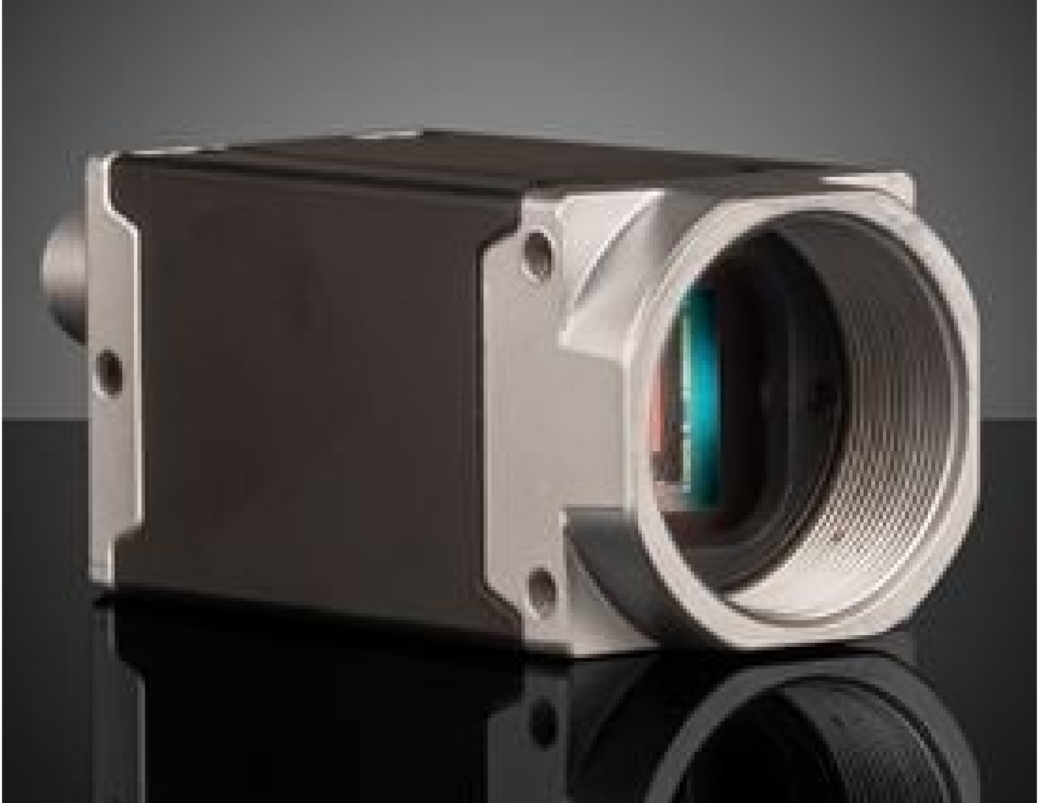
Basler ace2 GigE Cameras (Front)