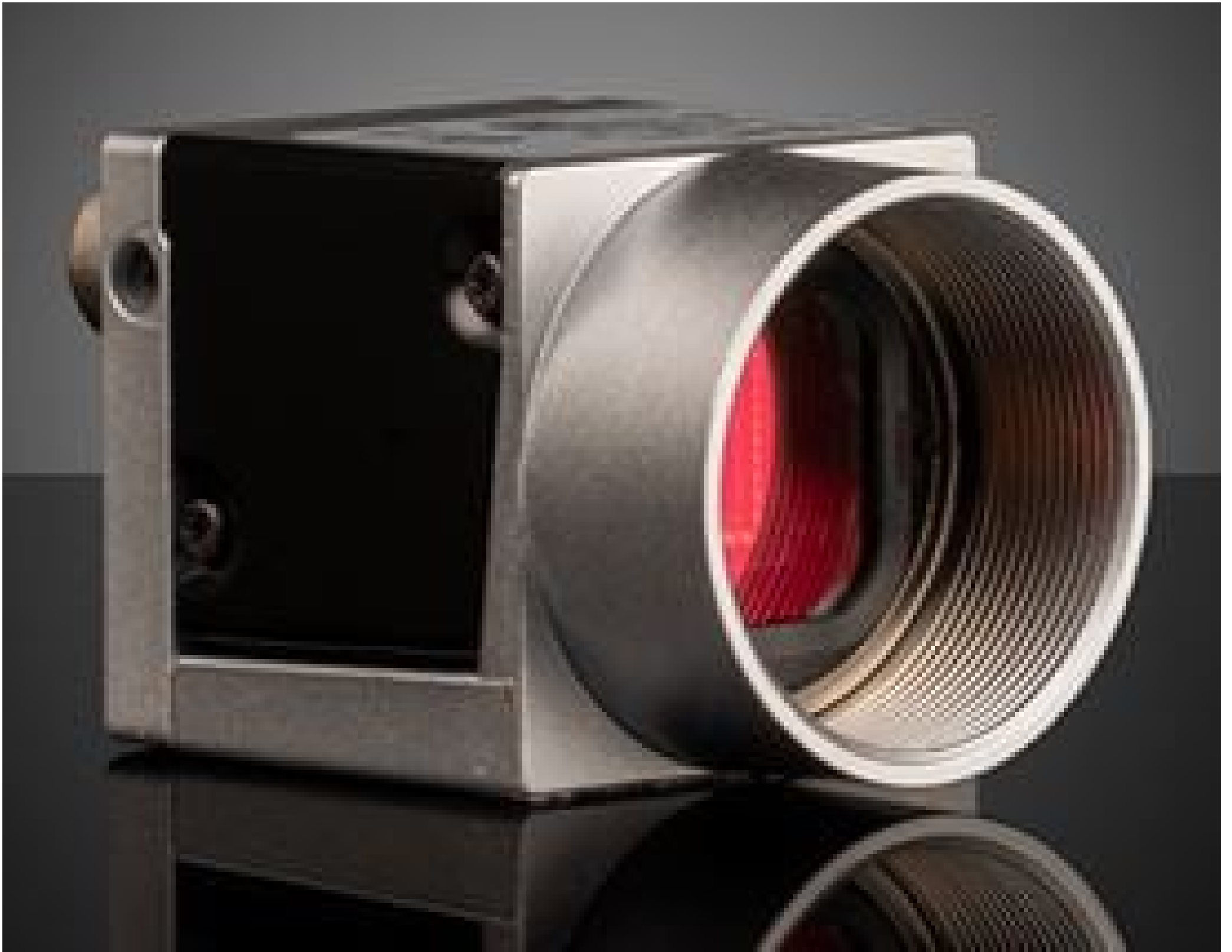
Basler ace USB 3.0 Cameras (Front)