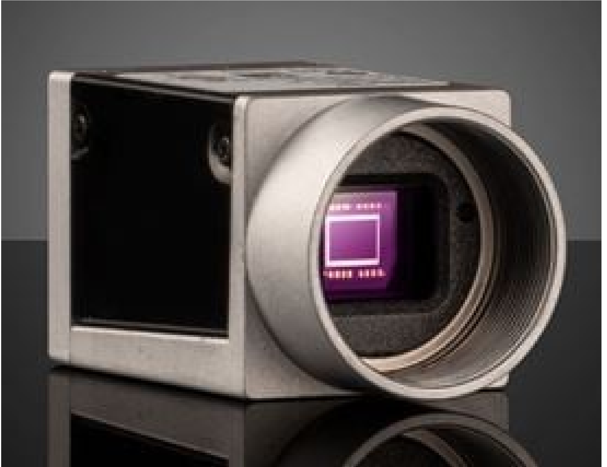
Basler ace GigE Cameras