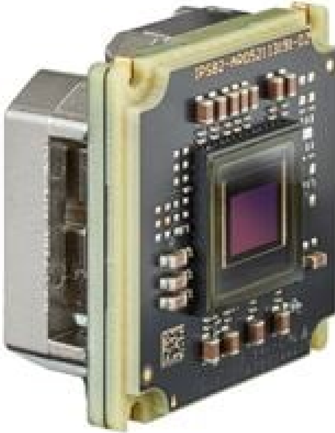
Allied Vision Alvium Camera, Board Level (Front)