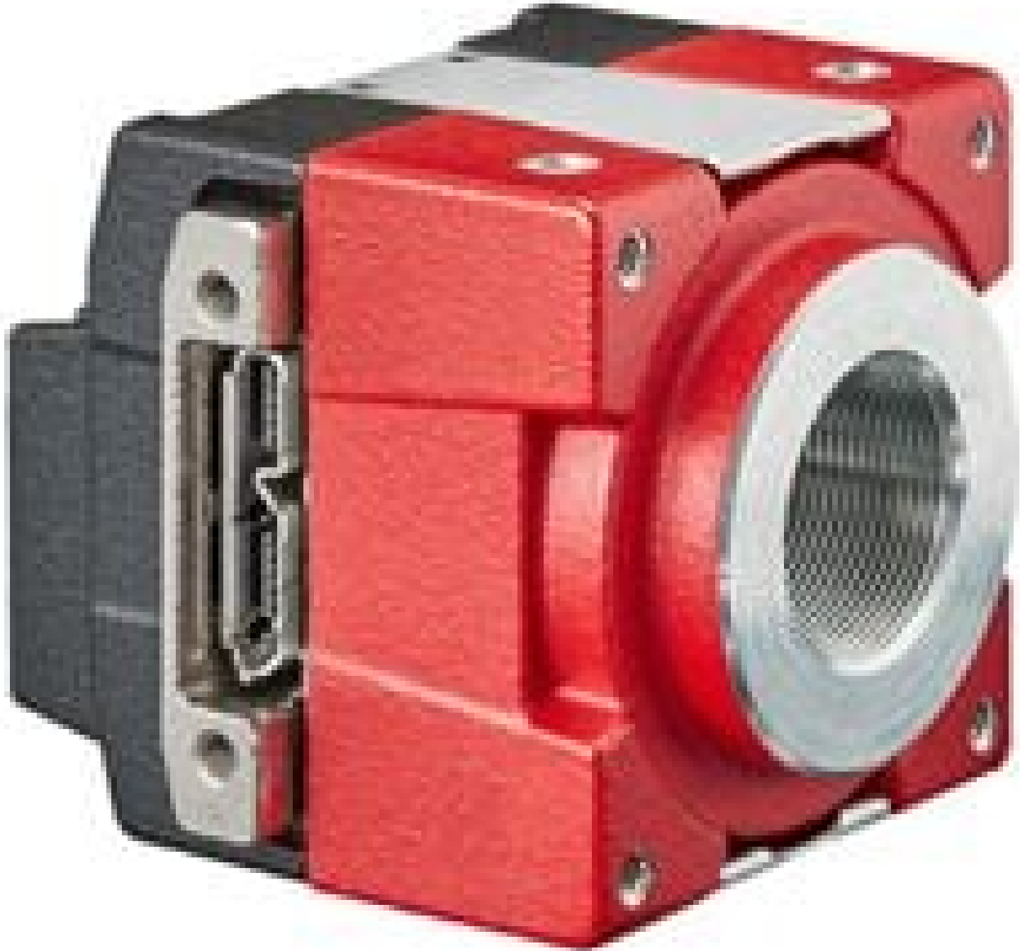
Allied Vision Alvium Camera, Full Housing, S-Mount, Right Angle IO Port (Front)