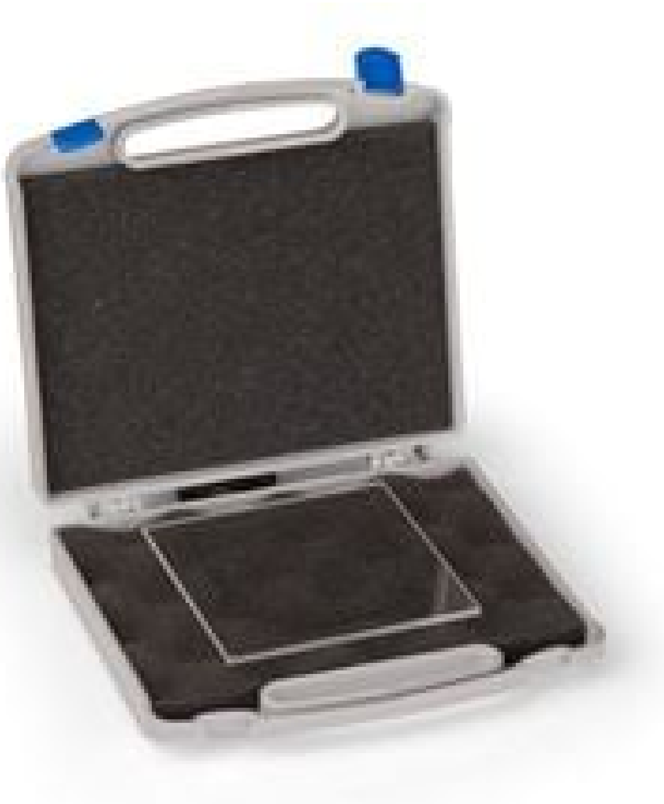
Particle Standard Target