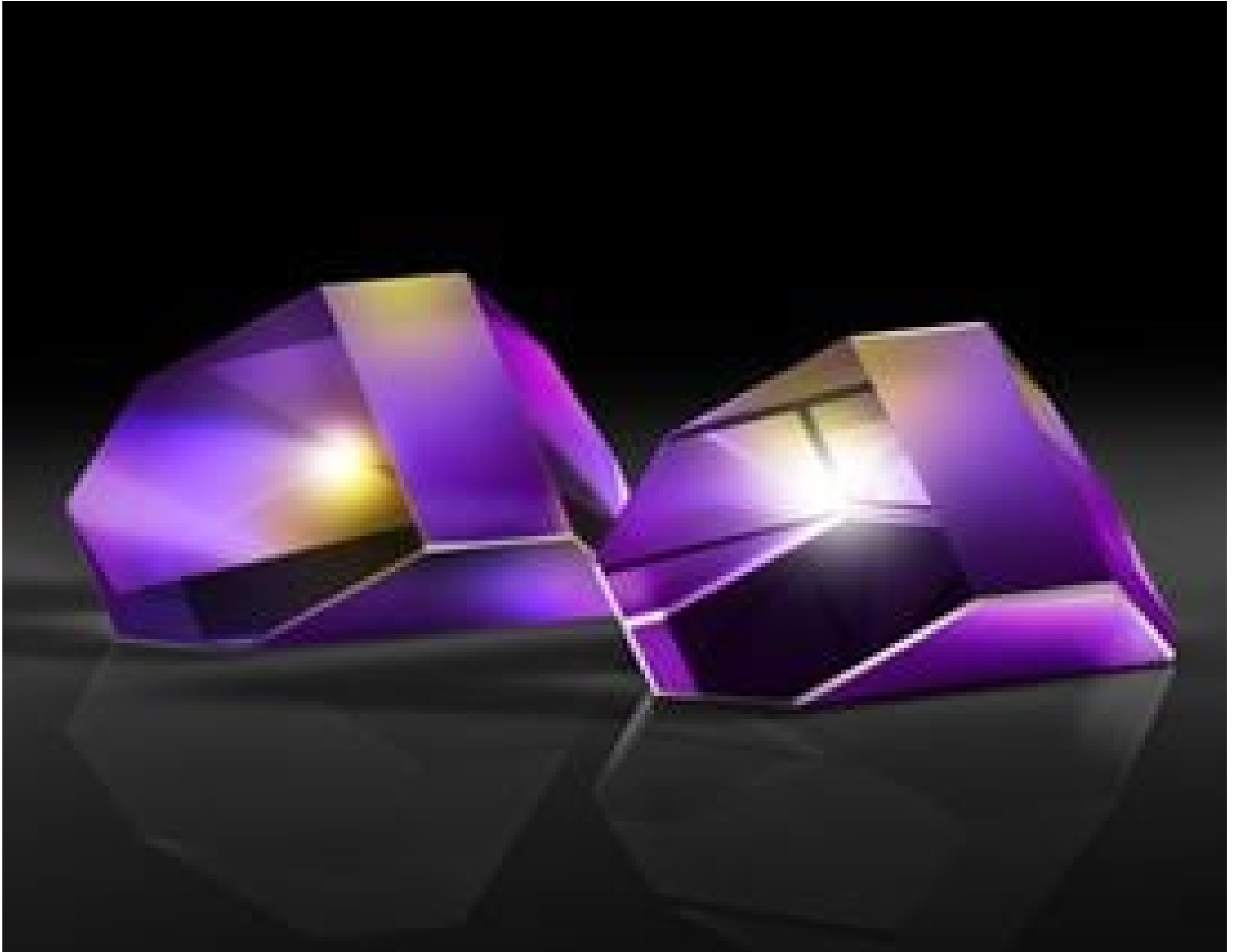
Amici Roof Prisms