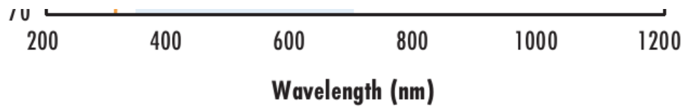
N-BK7 with VIS-NIR Coating Typical Transmission