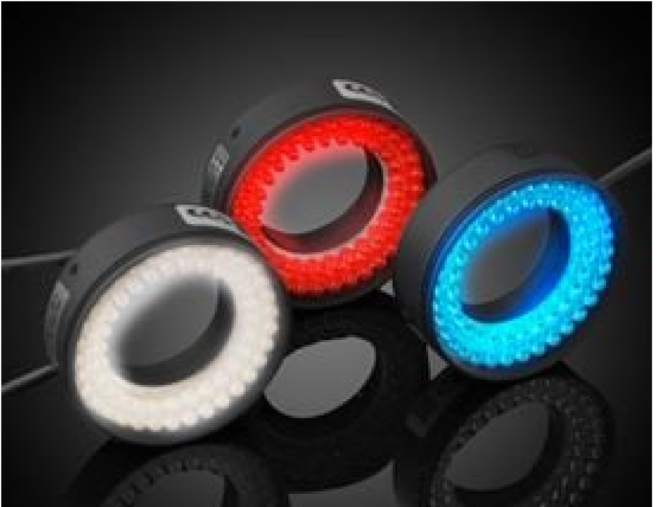
CCS High-Angle LED Ring Lights