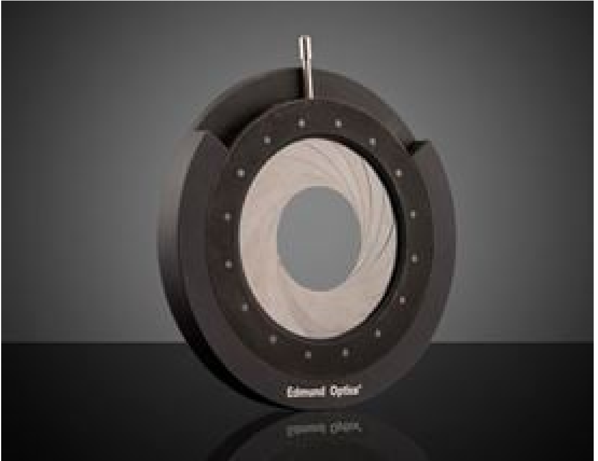
86mm Outer Diameter, Mounted Iris Diaphragm, #53-917