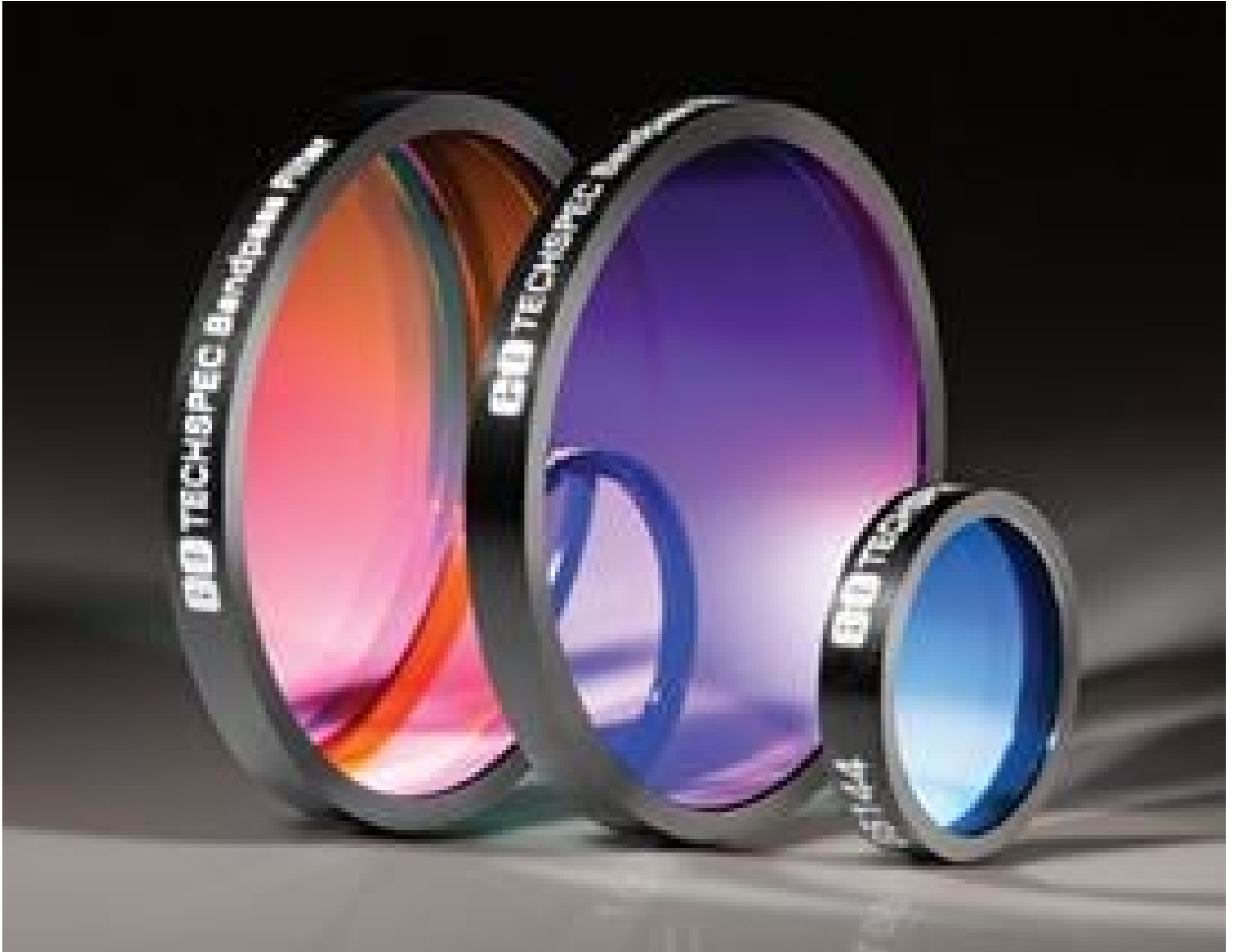
TECHSPEC Hard Coated OD 4.0 5nm Bandpass Filters