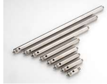
Stainless Steel Optical Mounting Posts