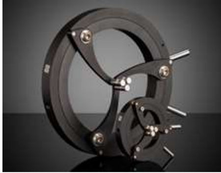
Self-Centering Jaw Clamps