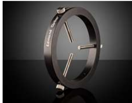
#03-670 - 19.5 - 108.0mm Optic Dia., Three-Screw Adjustable Ring Mount ₹11,501