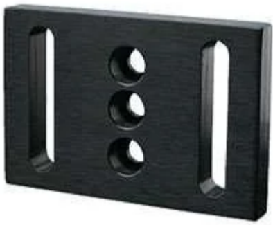
#03-655 - Sliding 2" x 3" Base Plate ₹2,548