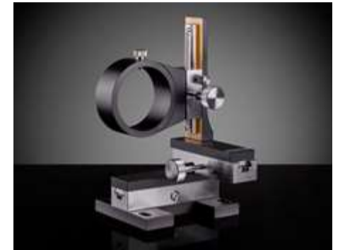
#03-607 - 50mm Diameter, X-Y-Z Positioning Movement ₹98,368