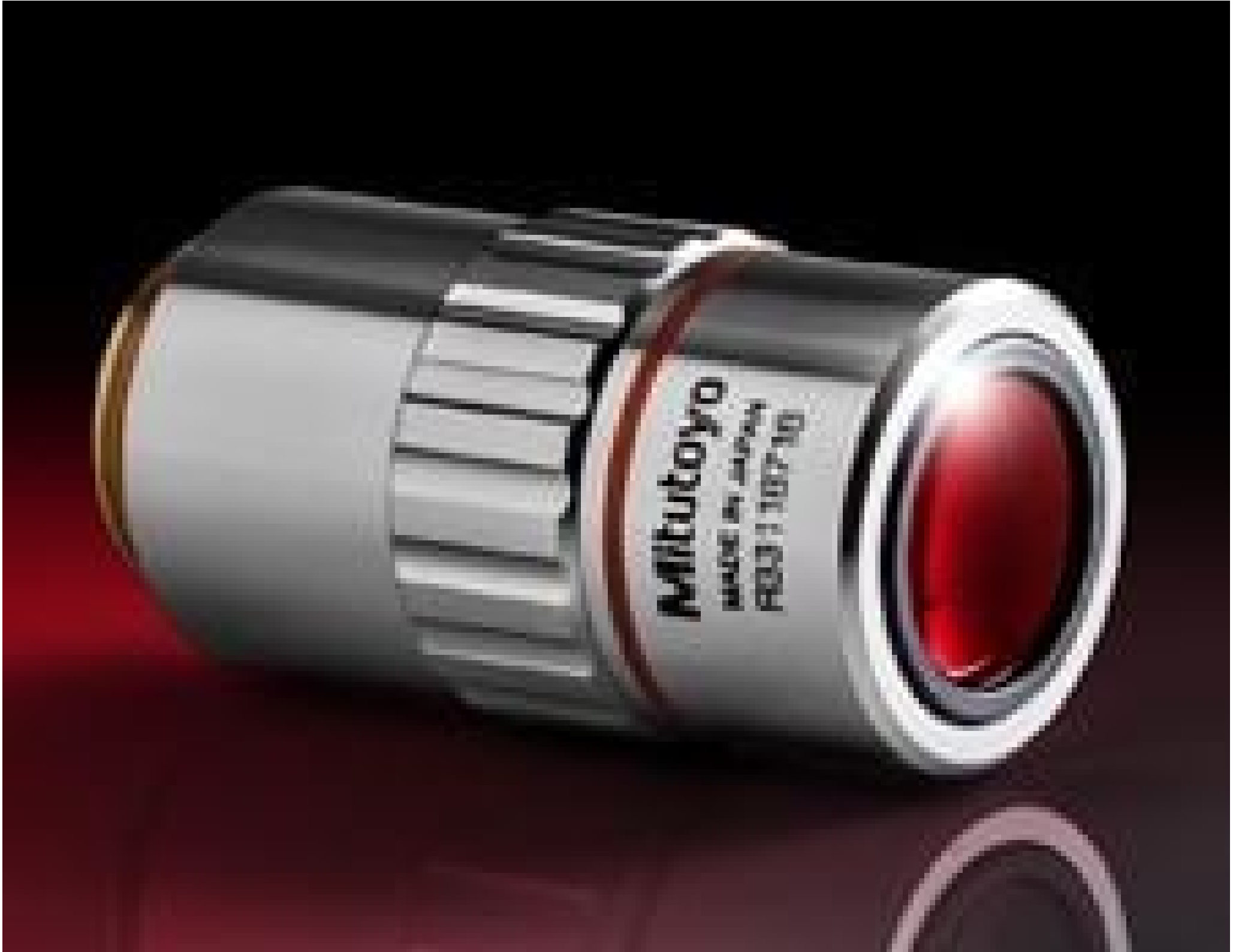
7.5X Mitutoyo Plan Apo Infinity Corrected Long WD Objective, #66-383