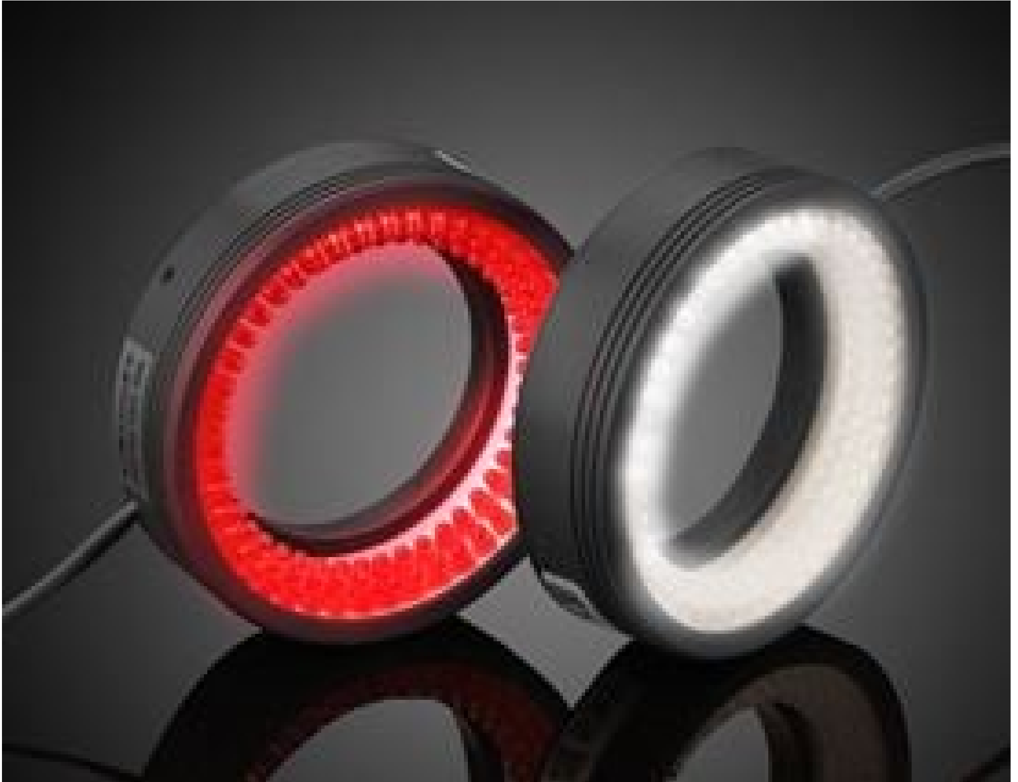
CCS Low-Angle LED Ring Lights