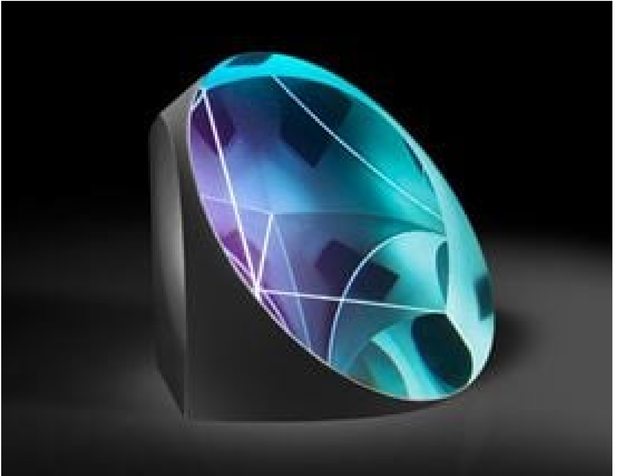
N-BK7 Corner Cube Retroreflectors with Black Overpaint