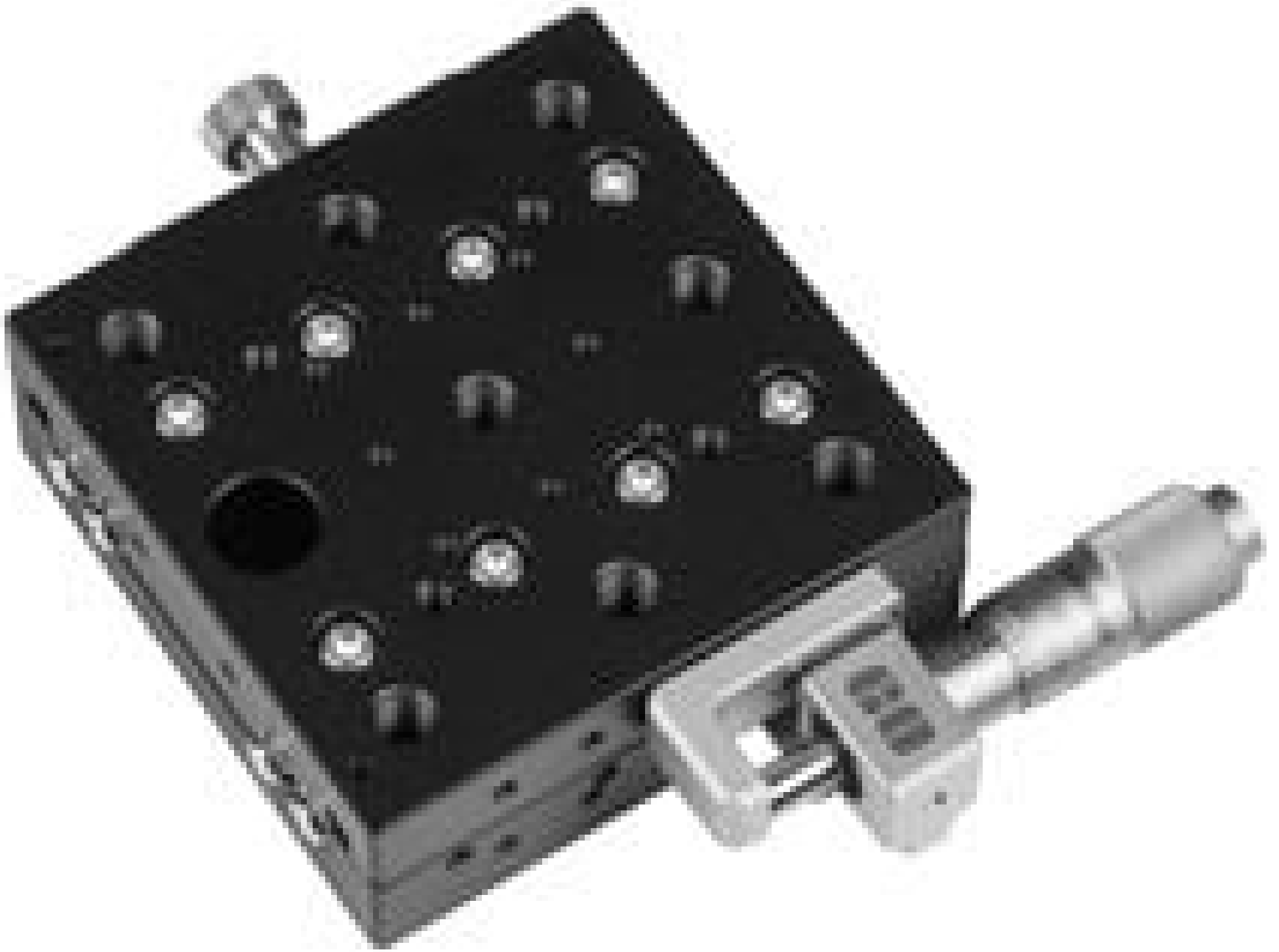
70mm, Side Drive, Solid Top, Micrometer Stage