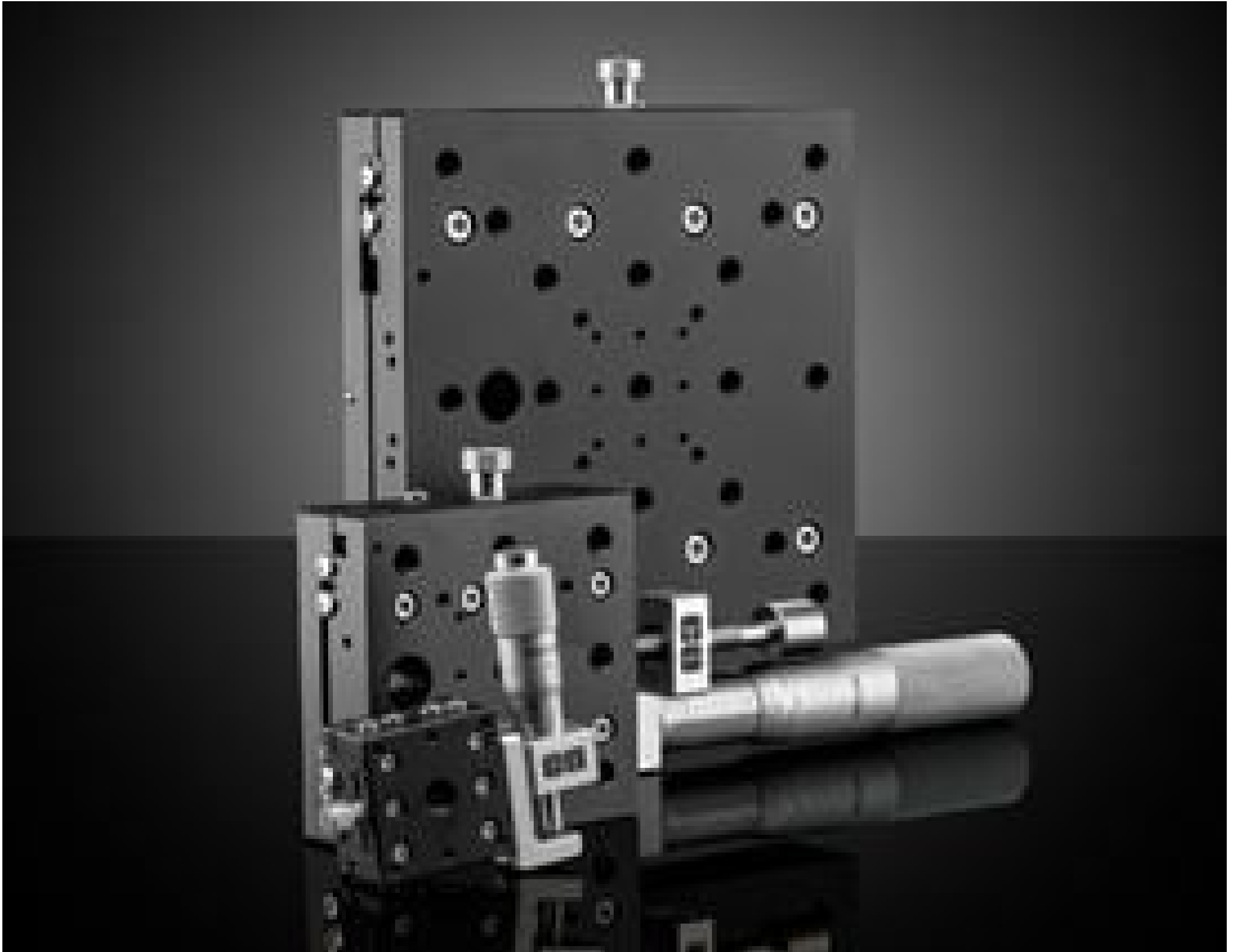
TECHSPEC® Crossed-Roller Bearing Linear Translation Stages (Standard-Top Model)