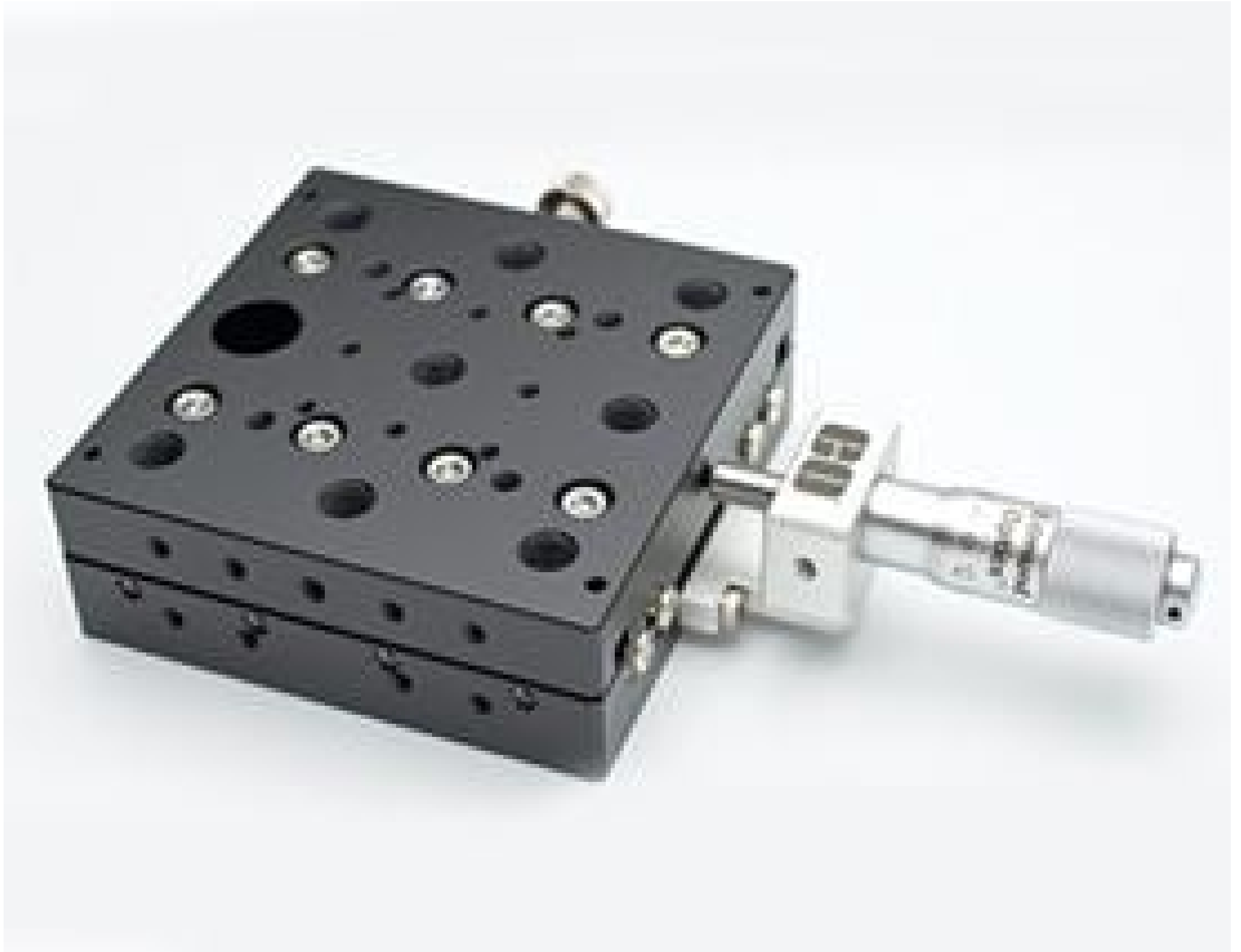
#66-427 - 70mm, 0.5" Travel, Micrometer Drive Stage (Center Drive)