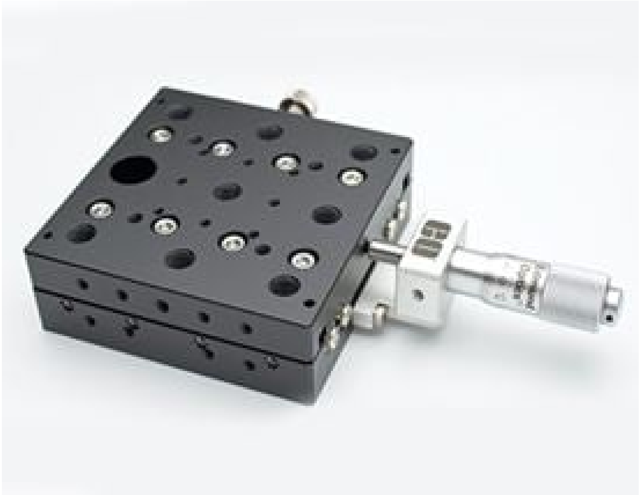
#66-427 - 70mm, 0.5" Travel, Micrometer Drive Stage (Center Drive)