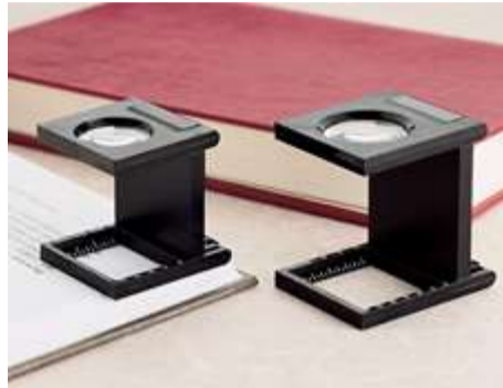
#31-313 - 6X Edmund Linen Tester w/ Case ₹4,647