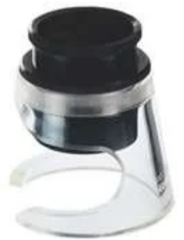
#31-327 - Edmund 6X Deluxe Wide Field Magnifier & Protective Case ₹21,983