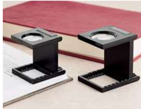
#31-314 - 9X Edmund Linen Tester w/ Case ₹4,647