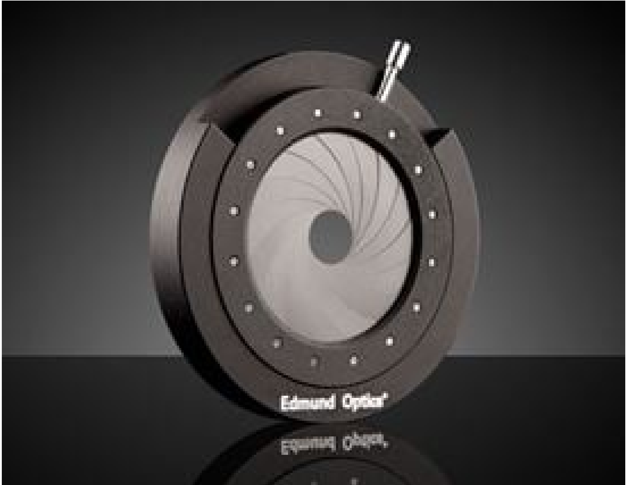
66mm Outer Diameter, Mounted Iris Diaphragm, #53-916