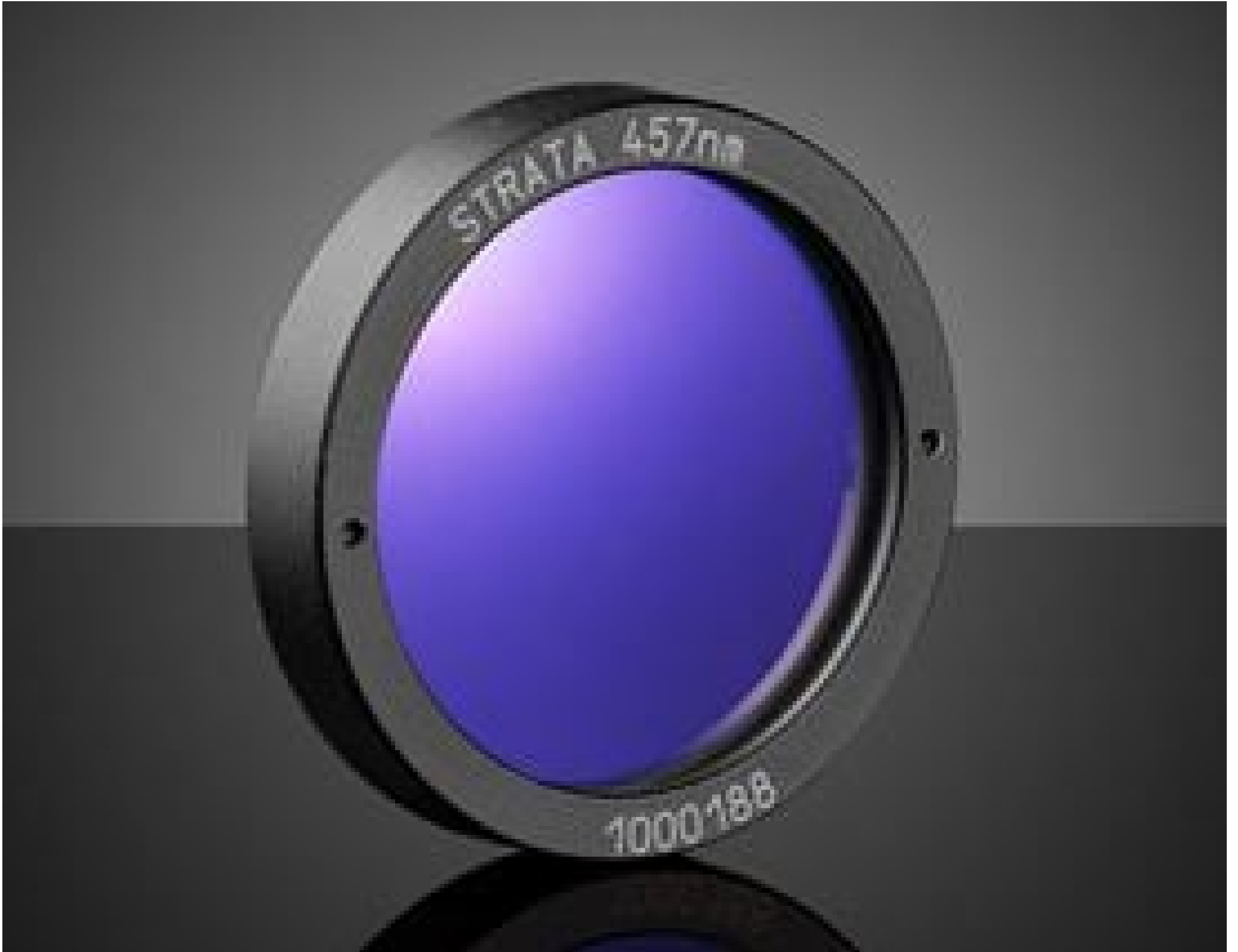
25.4mm META® holoOPTIX® STRATA Notch Filter