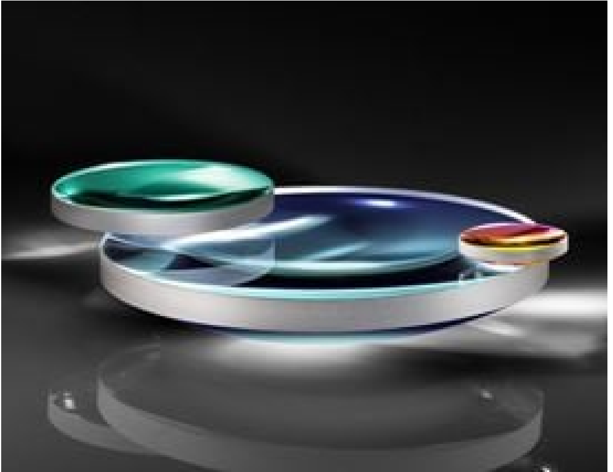
633nm Laser Line Coated Plano-Convex(PCX) Lenses