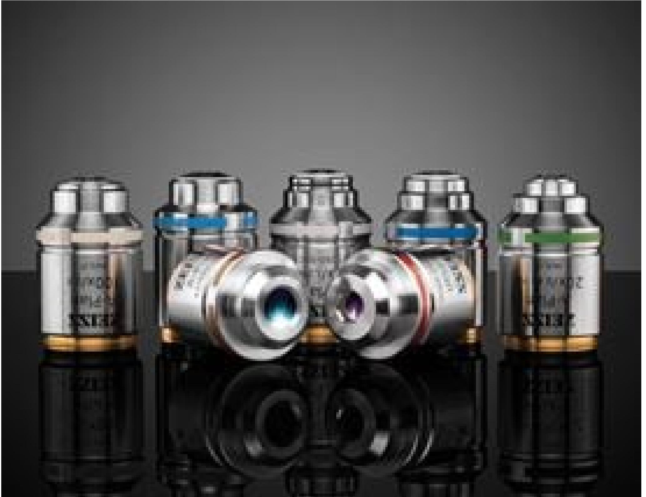
ZEISS A-Plan Objectives