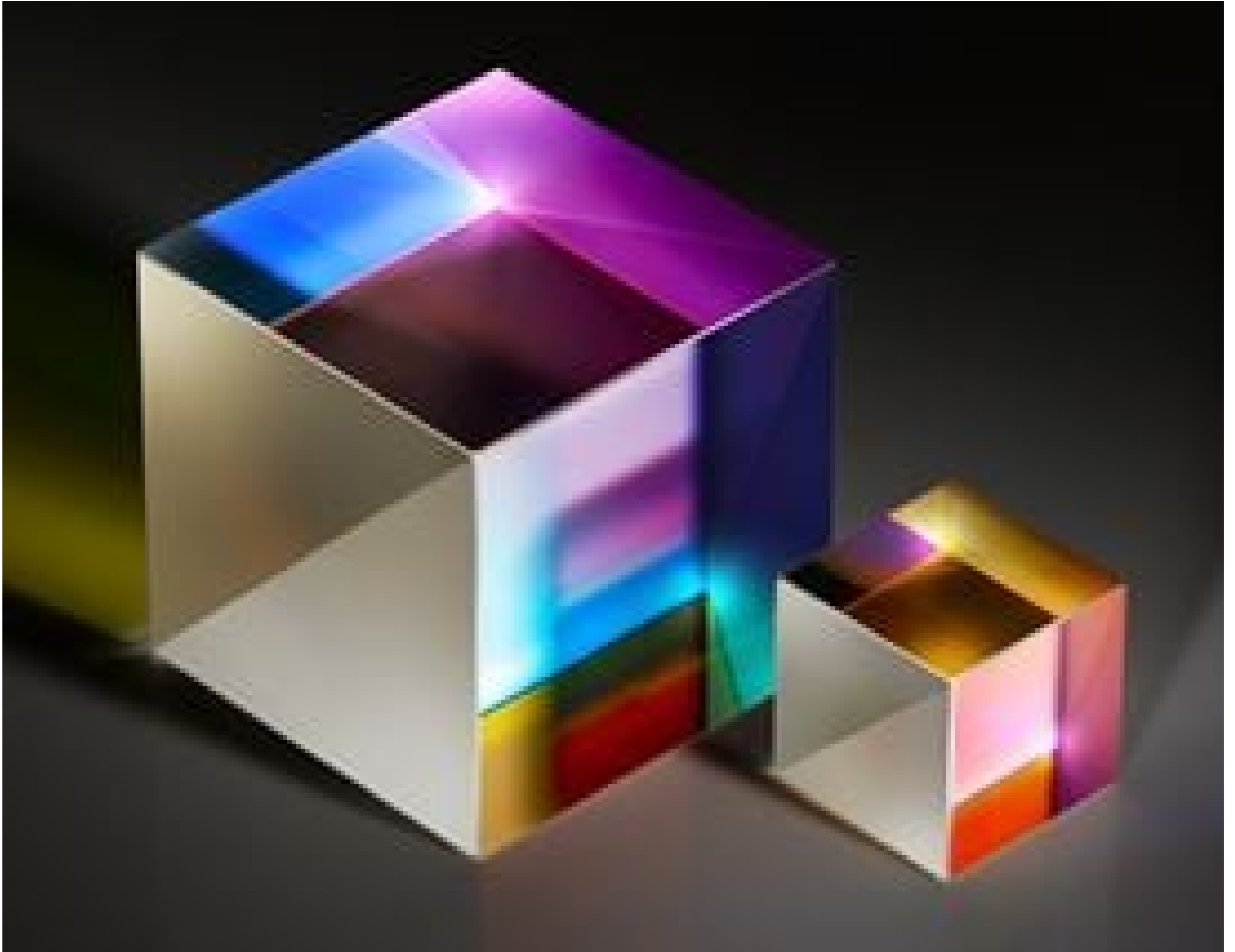
TECHSPEC® Broadband Polarizing Cube Beamsplitters