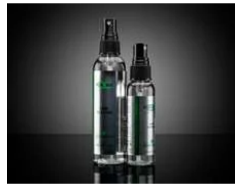
PUROSOL™ Optical Cleaner