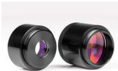
C, S, and T-Mount Circular Optic Mounts