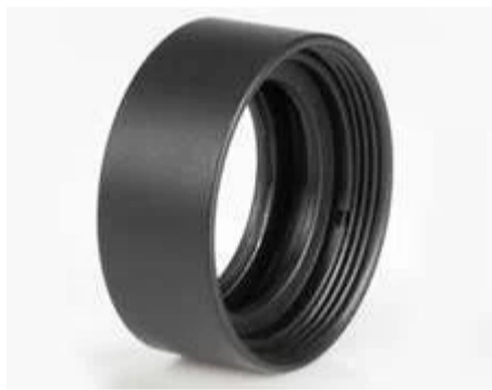
Cage System Optical Lens Mounts