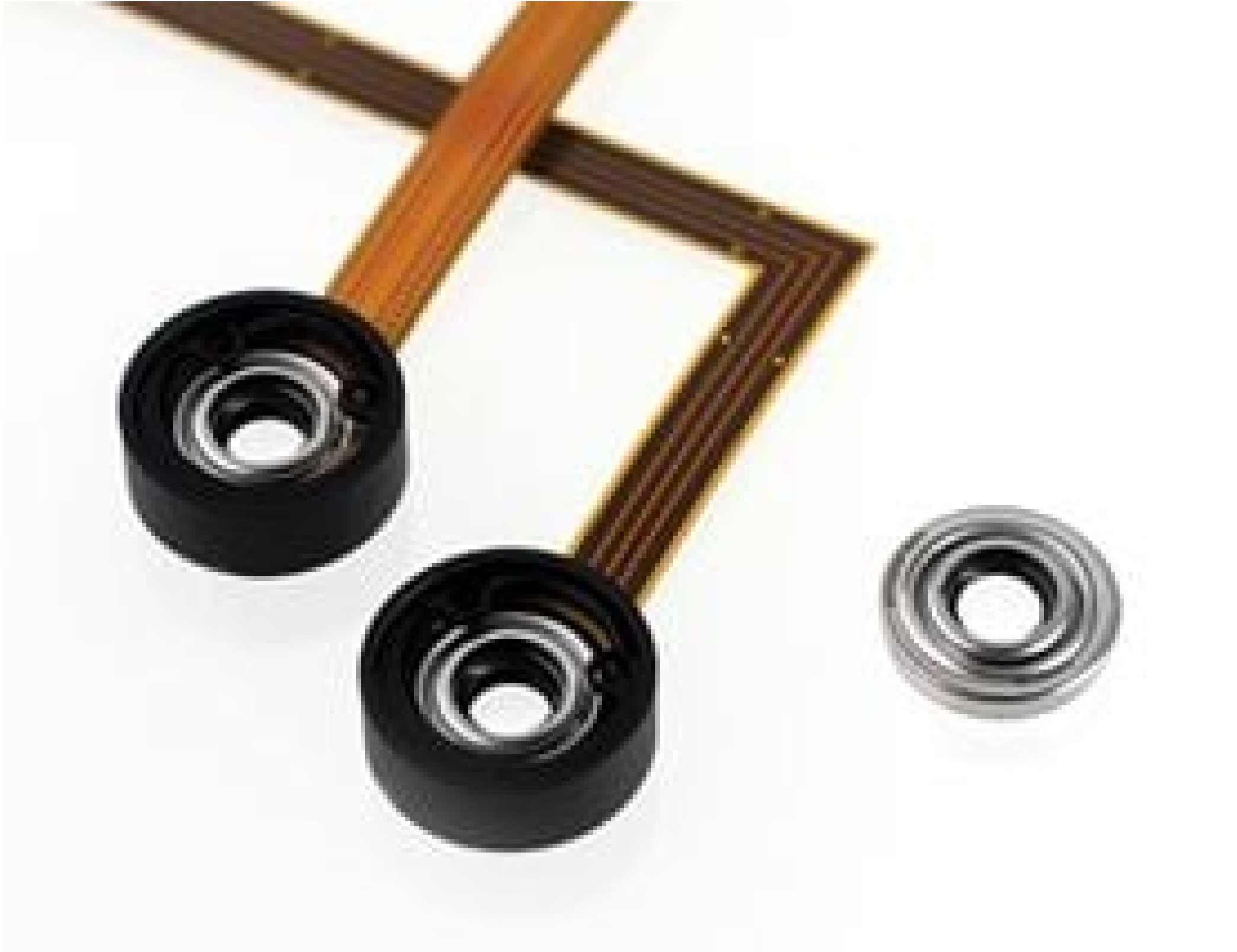
Corning® Varioptic® Variable Focus Liquid Lenses