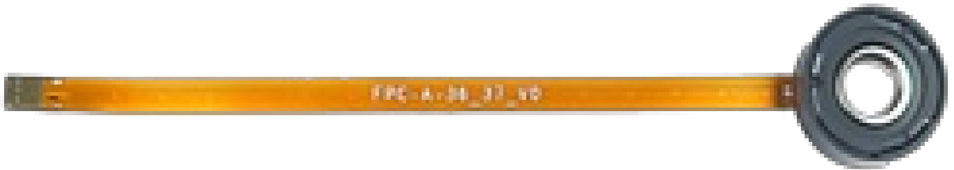
5.8mm CA, A-58NxP37 Corning® Varioptic® Variable Focus Liquid Lens