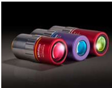
#56-983 - 100X Mitutoyo Plan Apo NIR HR Infinity Corrected Objective ₹12,25,548