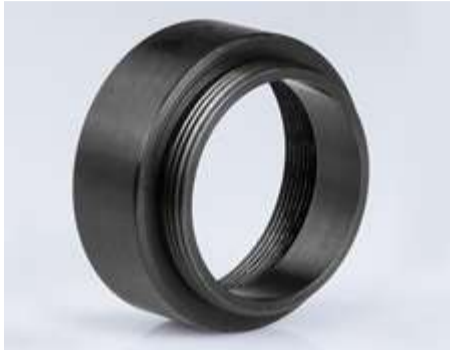
#55-743 - C-Mount Male to Mitutoyo (M26) Female Step-Up Adapter ₹5,246