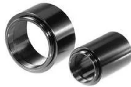
C, S, and T-Mount Extensions Tubes