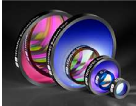
Hard Coated OD 4.0 10nm Bandpass Filters