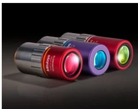
Mitutoyo NIR, NUV, and UV Infinity Corrected Objectives