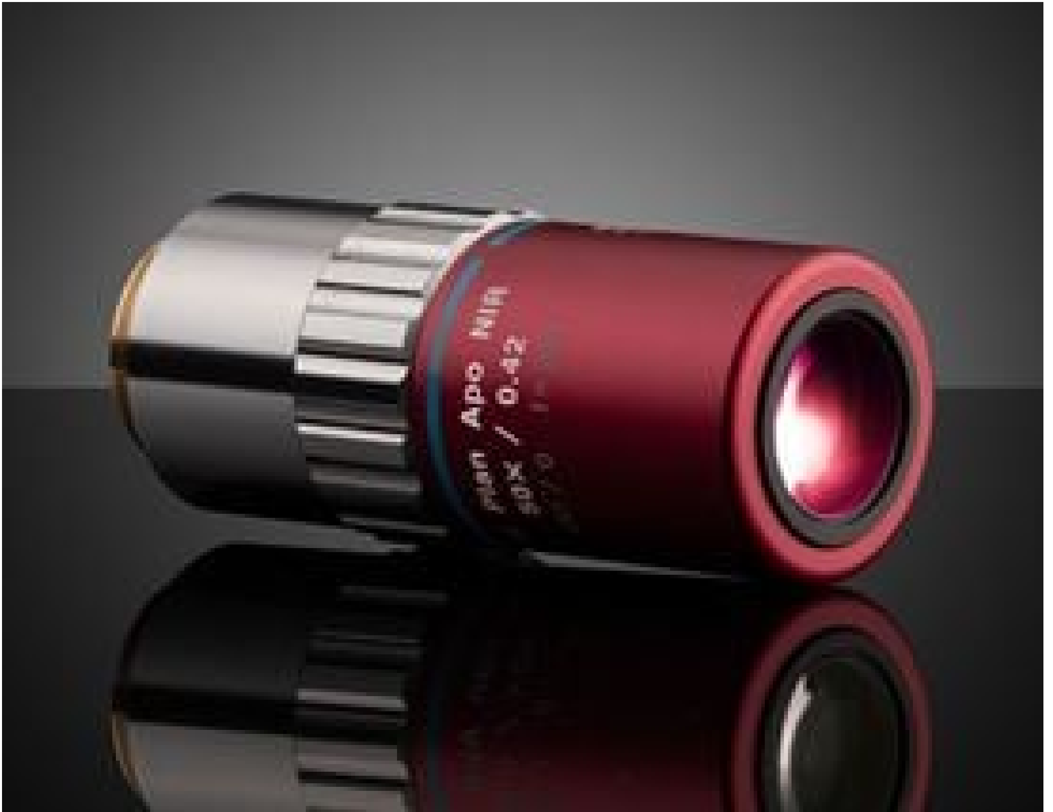
50X Mitutoyo Plan Apo NIR Infinity Corrected Objective, #46-405