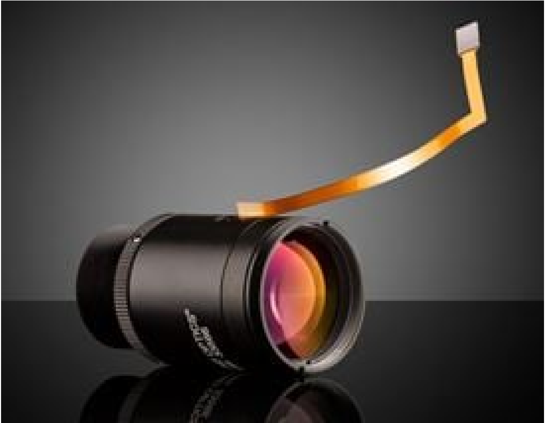
50mm, f/7, Liquid Lens Cx Series Fixed Focal Length Lens, #33-687