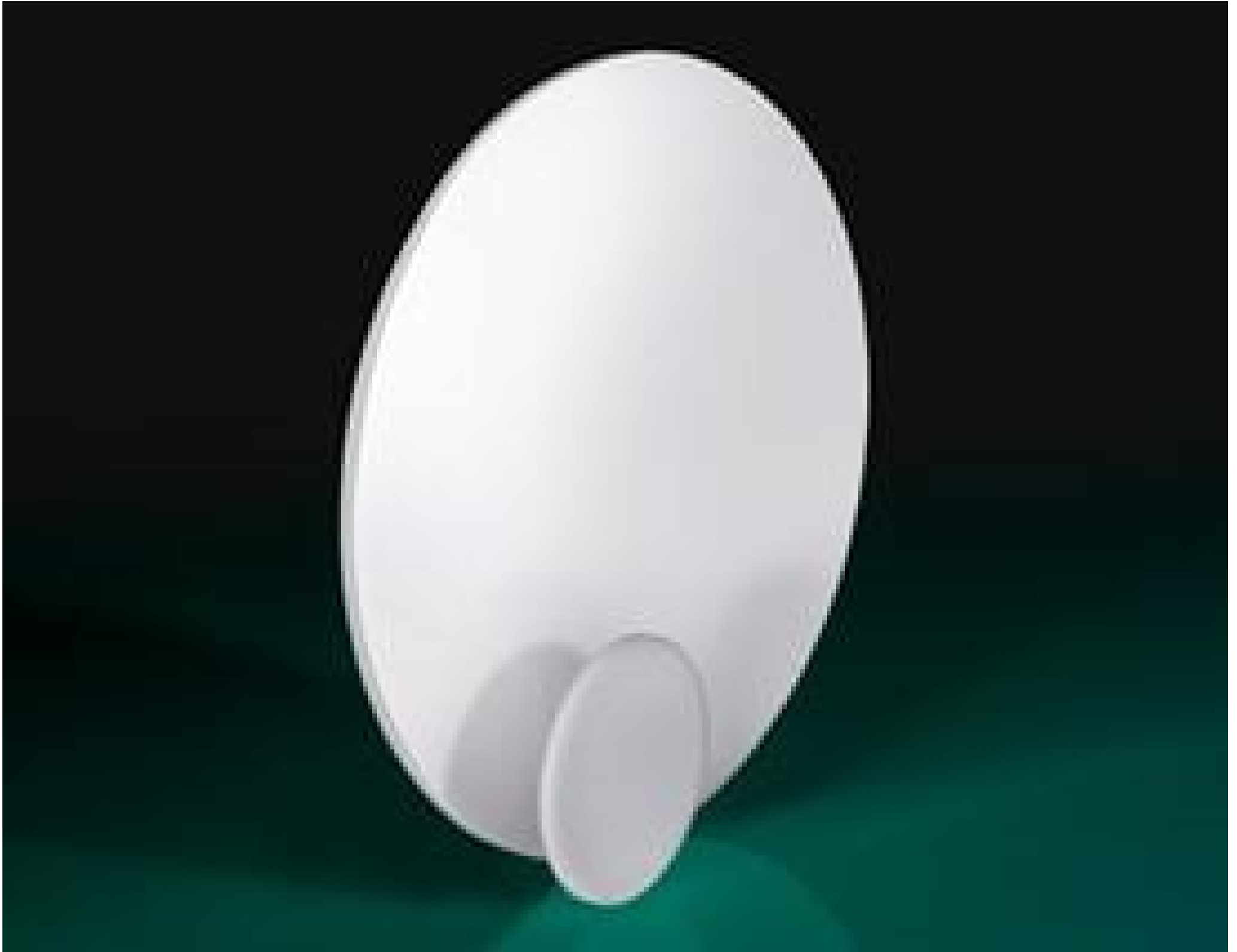
White Diffusing Glass