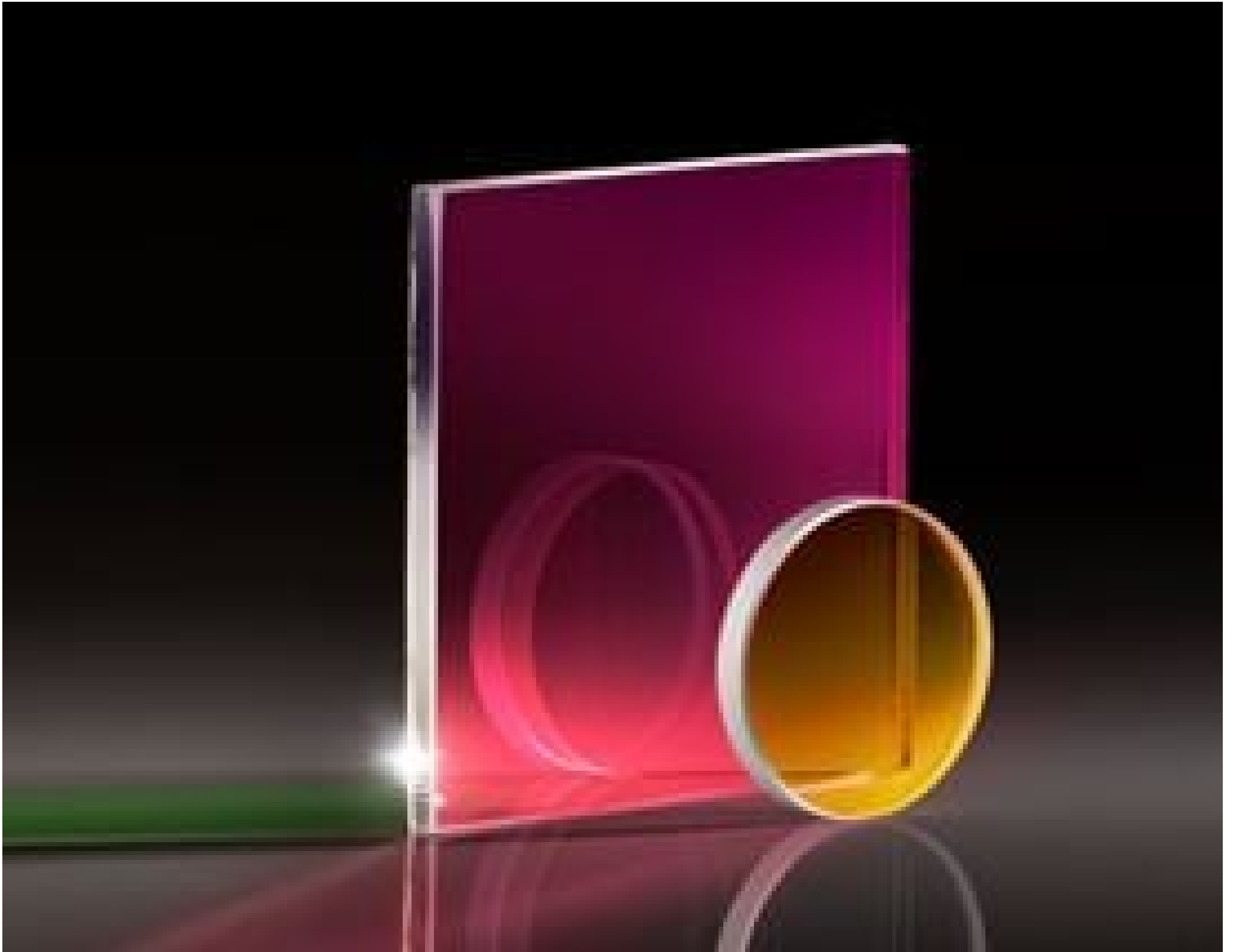
Extended Hot Mirrors