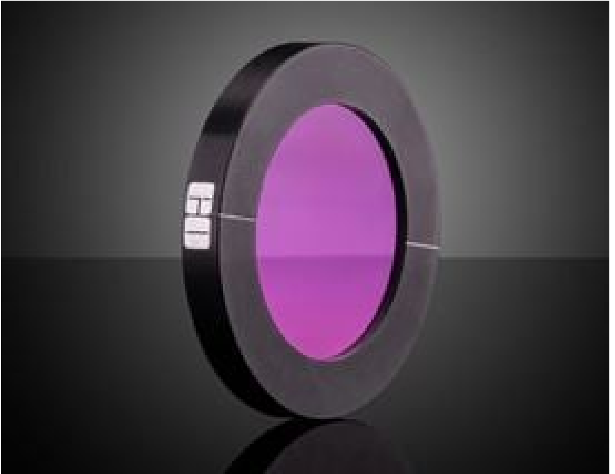
50mm Dia. BaF 2 , IR Holographic Wire Grid Polarizer, #62-771