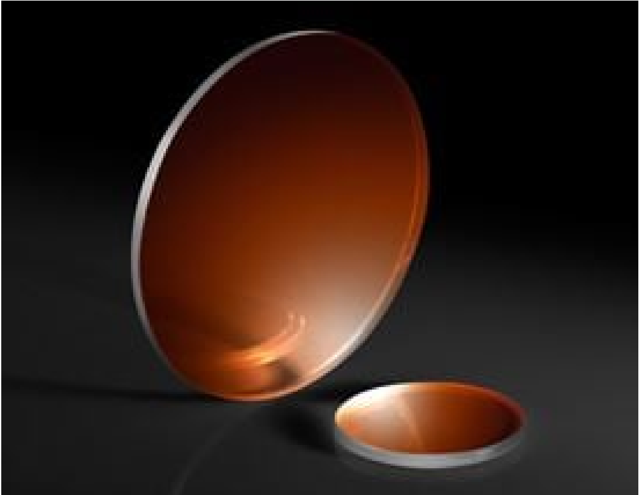
Lithium Fluoride (LiF) Windows