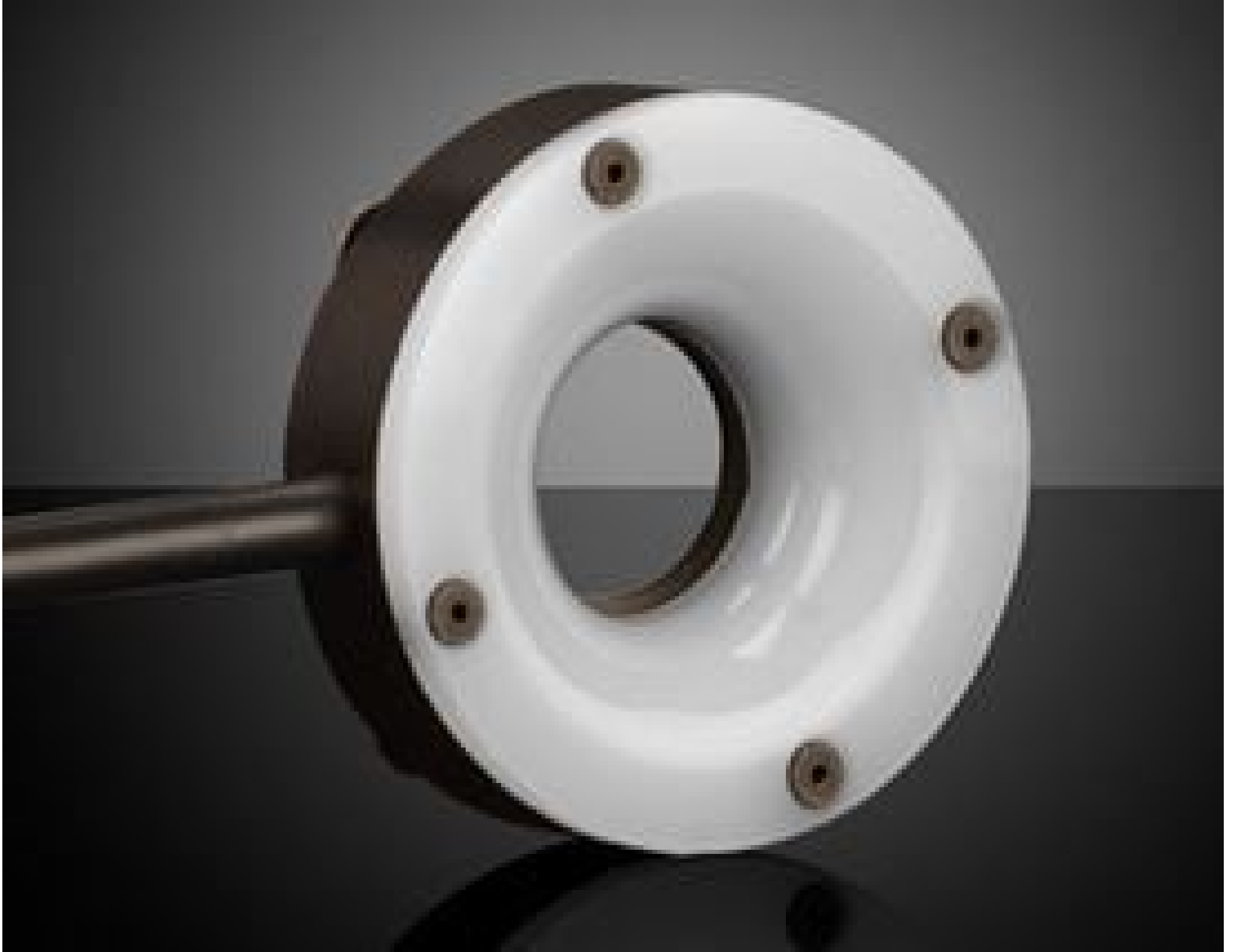
Advanced Illumination MicroBrite Diffuse Darkfield Ring Lights