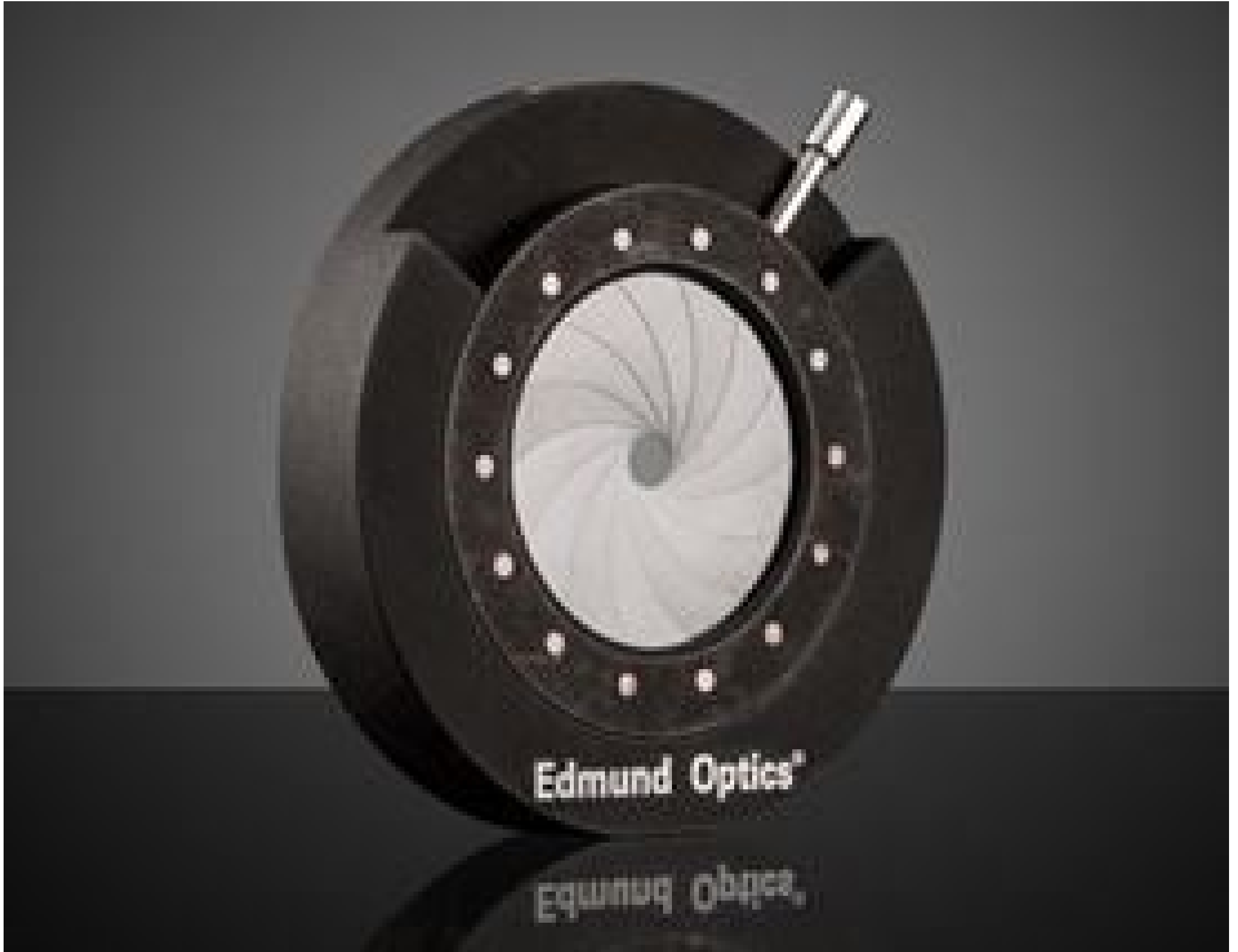
50.8mm Outer Diameter, Mounted Iris Diaphragm, #53-915