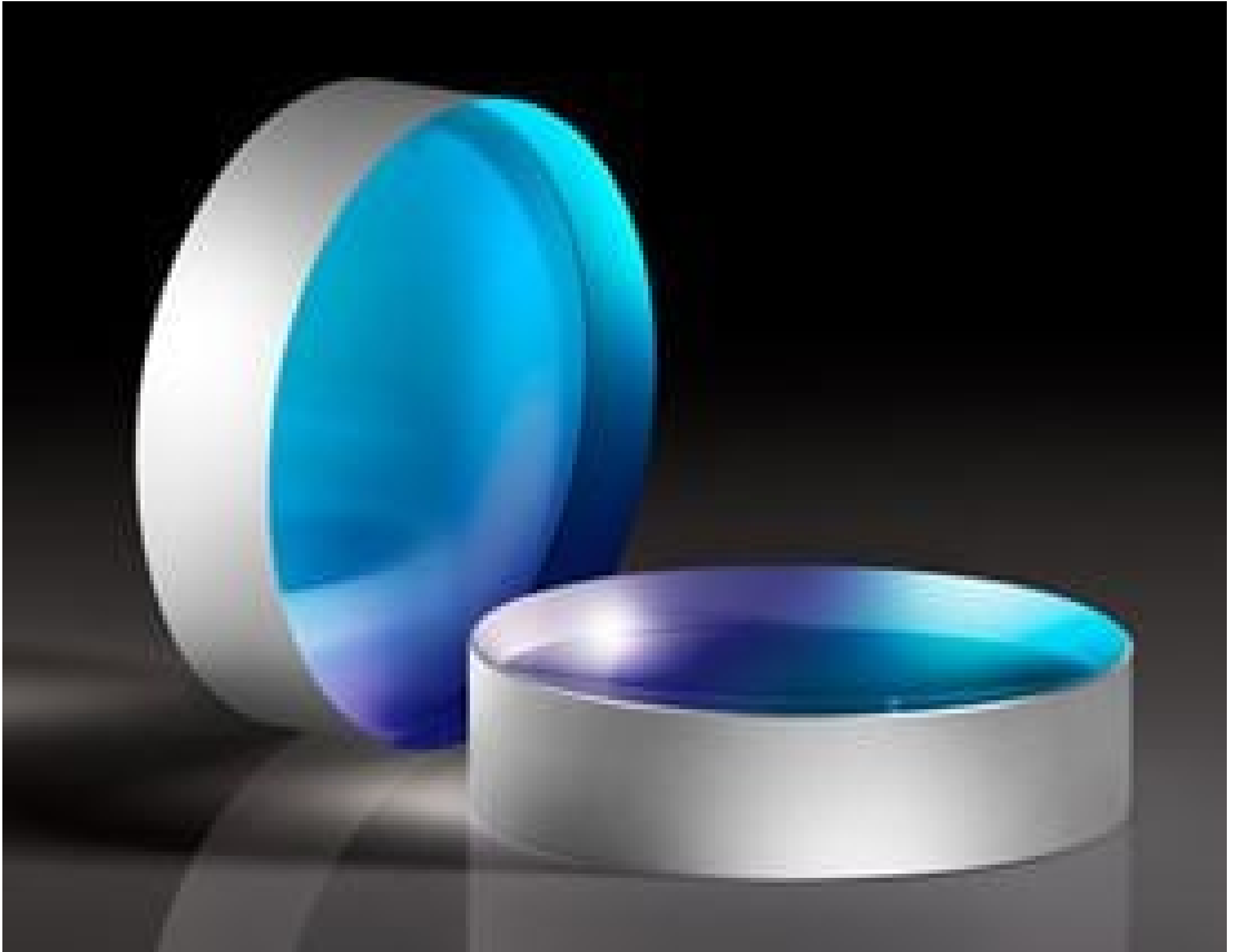
Laser Line Concave Mirrors