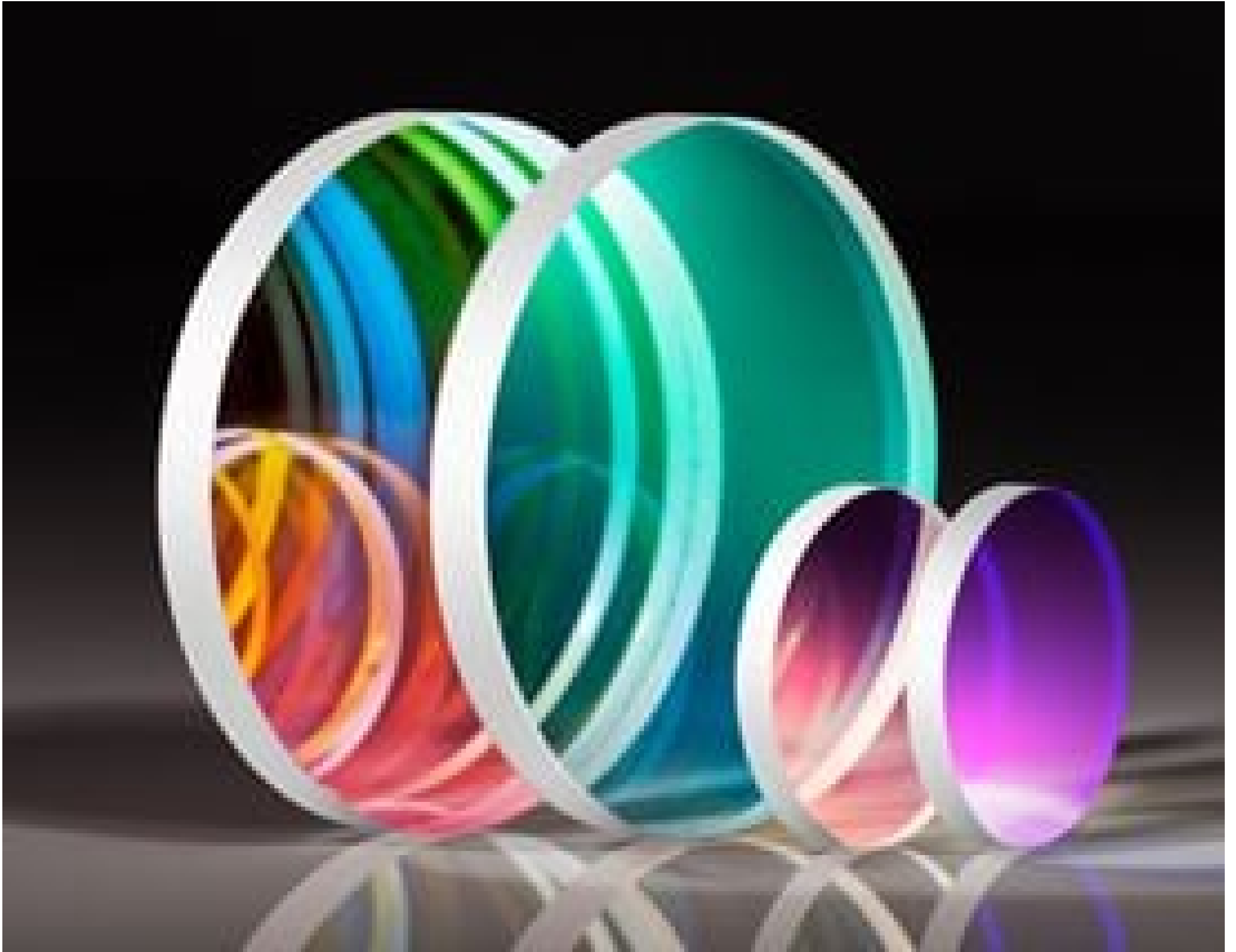
High Performance OD 4.0 Shortpass Filters