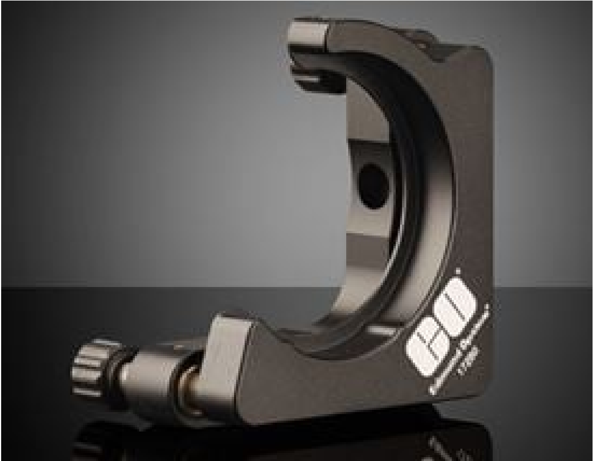
#17-280, 50.0/50.8mm Optic Dia., E-Series Clear Edge Kinematic Mount