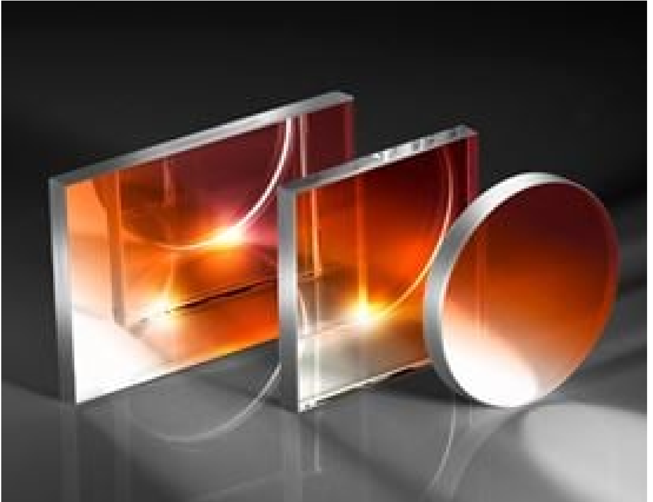
Visible and NIR Plate Beamsplitters